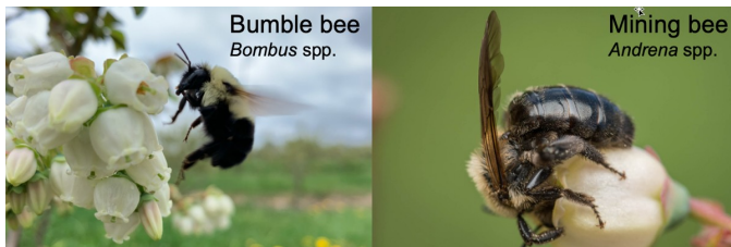
Figure 2. The common wild bees pollinating blueberry crops in central Pennsylvania. Both bumble bee queens (left) and mining bees (right) are active in early spring and are abundant pollinators of blueberries.

Since Pennsylvania lies within the native range of the blueberry, there is a great diversity of native bees that provide pollination services to blueberry farms. Observations performed in three small diversified farms with Bluecrop plantings in central Pennsylvania revealed that the smallest non-commercial planting had the greatest diversity of pollinators. While managed honey bee colonies were present at all sites, they were not commonly observed pollinating blueberries, compared to other wild bees such as bumble bees. For about every honey bee visiting blueberry flowers, we observed about 3 bumblebee queens (Figure 2). Mining bees in the genus Andrena were also a major group of wild bees observed at all sites (Figure 2). Both bumble bee queens and mining bees are active in the spring when blueberry flowers begin to bloom. At least 11 different species of Andrena have been observed pollinating blueberries in central Pennsylvania, often clinging to flowers during their visits.