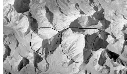
Figure 1: Left: a partition, with cells Everest , Lhotse and The Himalayas . Right: A part of the Himalayas seen from space, with Mount Lhotse (left) and Mount Everest (right).

The de dicto view of vagueness goes hand in hand with the doctrine of supervaluationism [5], [3], which is based on a redefinition of the notion of truth to accommodate the multiplicity of candidate precisifications associated with vague names or predicates. The basic idea is that, when determining the truth of an assertion containing a vague name or predicate, it is necessary to take into account all its candidate referents or extensions. In order to evaluate such an assertion semantically, we must effectively run through these candidates in succession and determine, for each particular choice, whether it makes the assertion true or false. An assertion such as 'Yul Brunner was bald' is supertrue because it is true for all such choices. An assertion such as 'Bill Clinton is bald' is superfalse because it is false for all such choices.