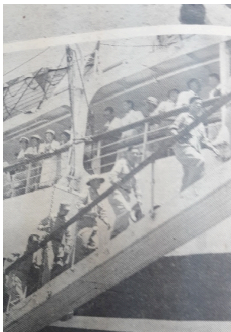
The former Japanese prisoners climbing the gangplank of the Hakusan Maru