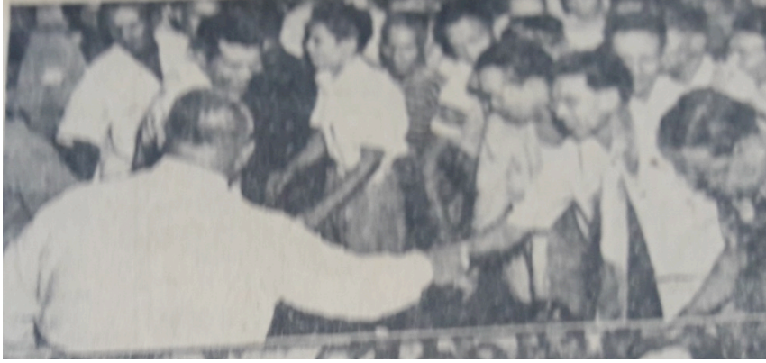
The Japanese convicts being congratulated after the announcement of the Presidential Clemency