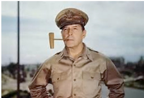
MacArthur: Paved the way for the resumption of Philippine-Japanese relations