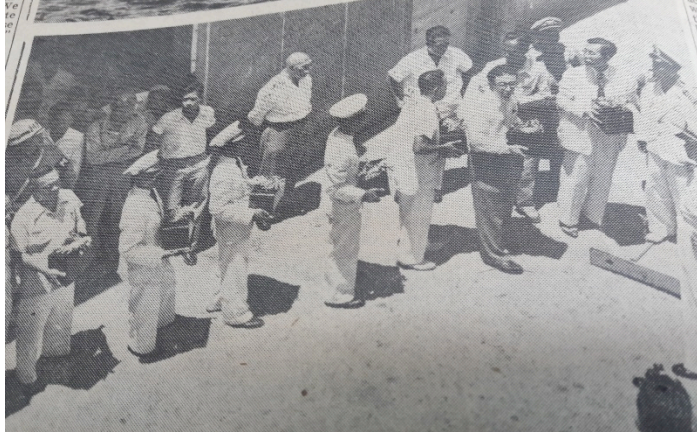
The loading of the urns containing the ashes of the 17 executed war prisoners aboard the Hakusan Maru

On July 21 the Hakusan Maru arrived at Yokohama harbour. Friends and relatives were excited to see their loved ones for the first time and some hired boats to go to Yokohama Harbor climb the ship to join their long absent family members. First to be unloaded were the urns containing the ashes of the convicted war criminals. These were sent to their final resting places. Fifty four prisoners were set free. Fifty six were sent to Sugamo to serve their definite and life sentences.(Bulletin Today, July 23, 1953, 4)