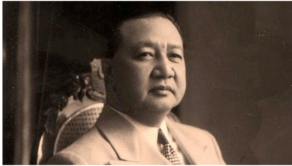
Elpidio Quirino, President of the Philippines, 1948-1953

The Philippines during the time of the Quirino administration was saddled with various pressing problems. Its economy and infrastructure was heavily damaged during the war. Postwar rehabilitation was among the government's top priorities. Though the country became independent from the United States it was also heavily dependent on its former colonizer for economic and military aid. This close association with the United States aligned the Philippines in the anti-communist bloc and it hosted American bases which were guaranteed to stay for 99 years from 1947 under a military agreement with the United States. The Philippines was also fighting a worsening communist insurgency led by the Hukbong Mapagpalaya sa Bayan (HMB) which was the Hukbalahap 2 during World War II. This neocolonial arrangement forced the Philippines to follow American policy. The Philippines aligned itself with the American-led anticommunist bloc and hosted American bases which was guaranteed to stay for 99 years from 1947 under a military bases agreement.