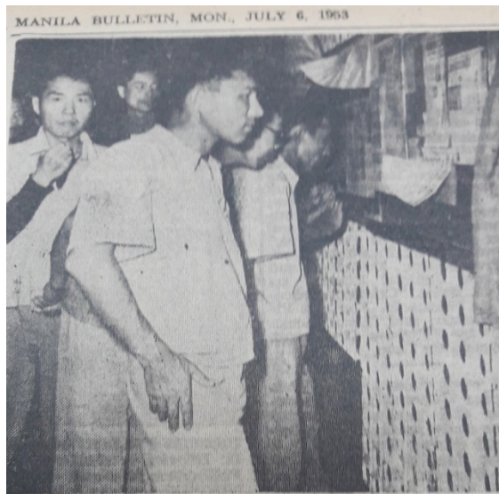
Japanese prisoners looking for their names among those who were pardoned by President Quirino