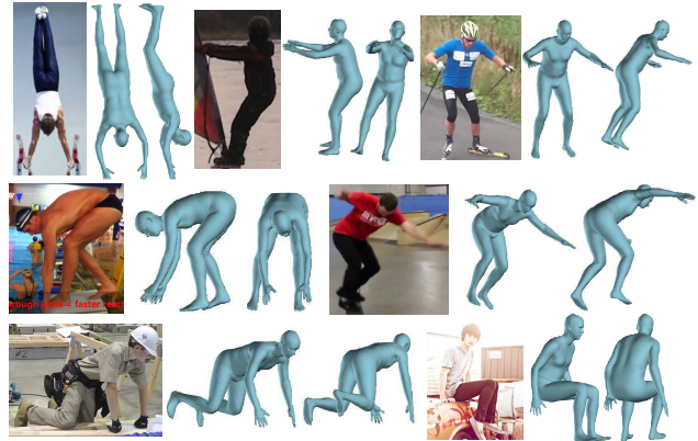
Figure 3. Successful 3D pose and shape predictions of our approach on challenging examples of UP-3D.

either from UP-3D (provided by Lassner et al. [22]), or from CMU MoCap (provided by Varol et al. [51]). The Human2D network remains the same in both cases.