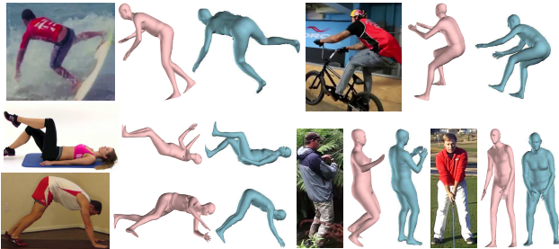
Figure 4. Examples from UP-3D where our approach (blue shapes) performs significantly better than the direct prediction method of Lassner et al. [22] (pink shapes).

performance benefit. This is an interesting empirical result demonstrating that training with reprojection losses can be useful not only for end-to-end refinement, but it can also assist the network with novel information recovered from 2D annotations. Some qualitative results from UP-3D using our best model are presented in Figure 3.