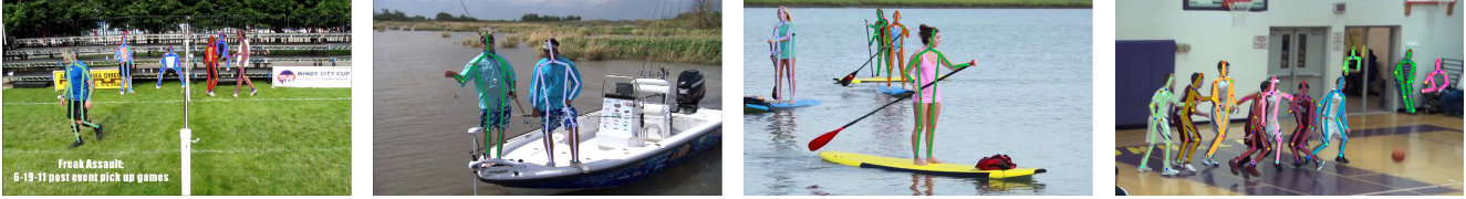
Figure 5: Selected frames from sample sequences with MOTA score above 75% with predictions of our ArtTrack-baseline overlaid in each frame. See text for further description.