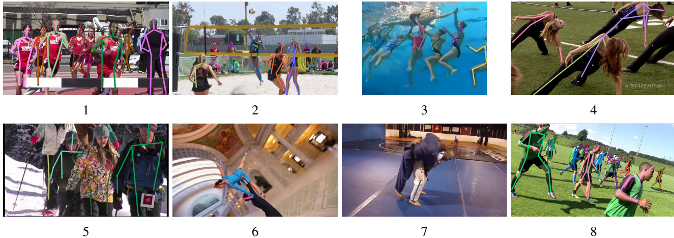
Figure 6: Selected frames from sample sequences with negative average MOTA score. The predictions of our ArtTrack-baseline are overlaid in each frame. Challenges for current methods in such sequences include crowds (images 3 and 8), extreme proximity of people to each other (7), rare poses (4 and 6) and strong camera motions (3, 5, 6, and 8).

accuracy are affected by pose complexity. As a measure for the pose complexity of a sequence we employ an average deviation of each pose in a sequence from the mean pose. The computed complexity score is used to sort video sequences from low to high pose complexity and average mAP is reported for each sequence. The result of this evaluation is shown in Fig. 4 (middle). For visualization purposes, we partition the sorted video sequences into bins of size 10 based on pose complexity score and report average mAP for each bin. We observe that both body pose estimation and tracking performance significantly decrease with the increased pose complexity. Fig. 4 (right) shows a plot that highlights correlation between mAP and MOTA of the same sequence. We use the mean performance of all methods in this visualization. Note that in most cases more accurate pose estimation reflected by higher mAP indeed corresponds to higher MOTA. However, it is instructive to look at sequences where poses are estimated accurately (mAP is high), yet tracking results are particularly poor (MOTA near zero). One of such sequences is shown in Fig. 6 (8). This sequence features a large number of people and fast camera movement that is likely confusing simple frame-to-frame association tracking of the evaluated approaches. Please see supplemental material for additional examples and analyses of challenging sequences.