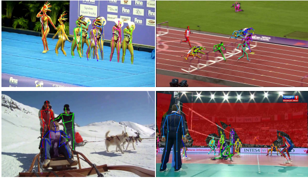
Figure 2: Example frames and annotations from our dataset.

on multi-person articulated tracking, progress in the single-frame setting will inevitably improve overall tracking quality. We thus make the single frame multi-person setting part of our evaluation procedure. In order to enable timely and scalable evaluation on the held-out test set, we provide a centralized evaluation server. We strongly believe that the proposed benchmark will prove highly useful to drive the research forward by focusing on remaining limitations of the state of the art.