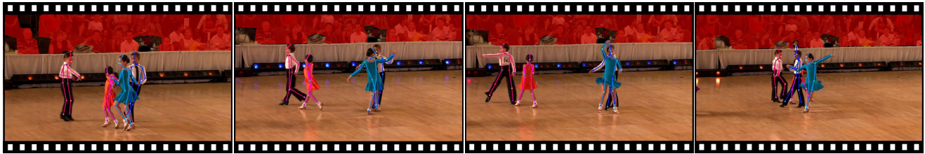
Figure 1: Sample video from our benchmark. We select sequences that represent crowded scenes with multiple articulated people engaging in various dynamic activities and provide dense annotations of person tracks, body joints and ignore regions.