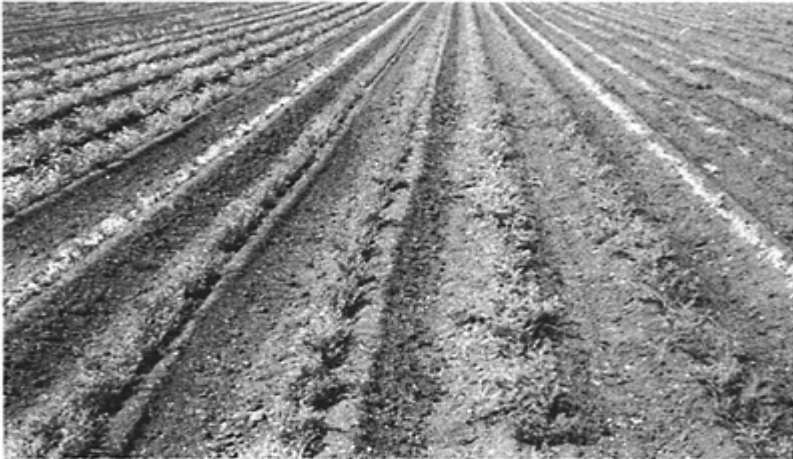
Figure 7.2 A Fusarium wilt screening nursery at ICRISAT.

Botrytis gray mold (BGM), caused by the necrotrophic fungus Botrytis cinerea Pres., is an important foliar disease of chickpea in northern India, Nepal, Bangladesh, and Pakistan (Haware and McDonald, 1992) and has been reported from more than 15 countries (Nene et al., 1996), including Australia (Corbin, 1975) and North America (Kharbanda and Bernier, 1979). High levels of resistance have not been found in the cultivated species (Haware and Nene, 1982; Haware and McDonald, 1993). Some accessions with erect plant type, such as ICCL 87322 and ICCV 88510, were found to be less affected by the disease (Haware and McDonald, 1993).