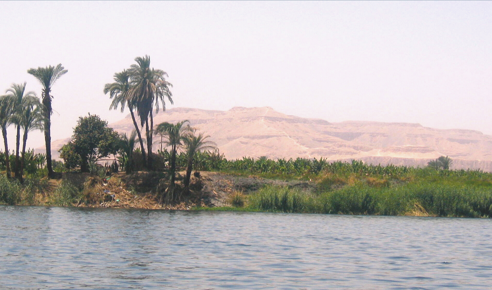
The Nile at Luxor, Egypt