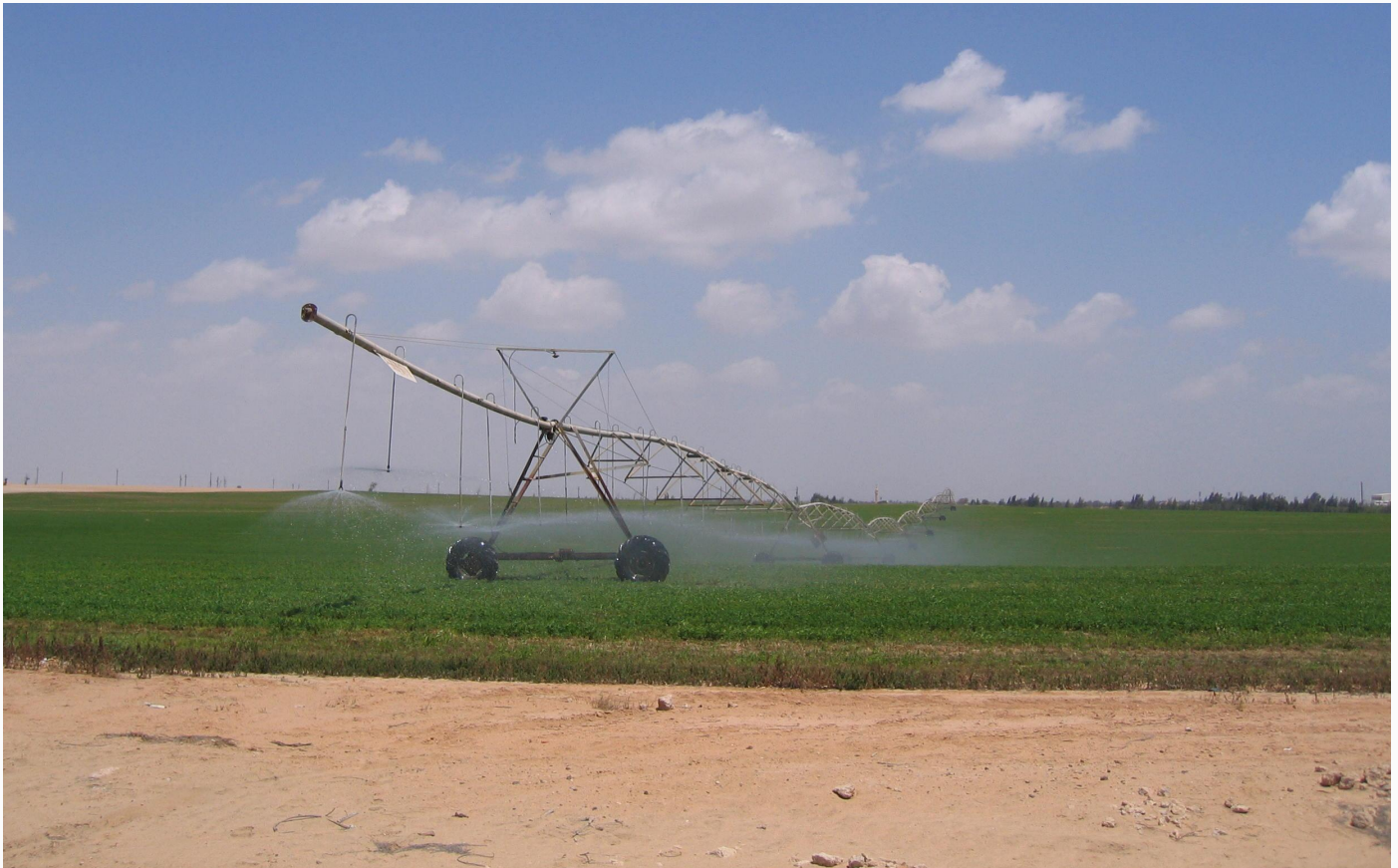
Center-pivot sprinkler irrigation, Egypt