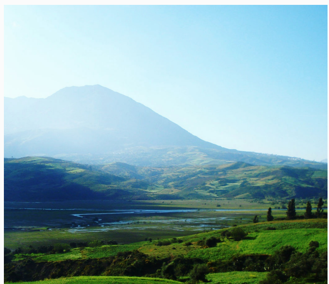
The Rif Mountains, Morocco