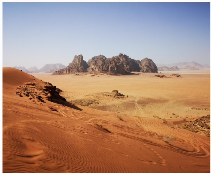
Wadi Rum, Jordan

As for the population part of the narrative, the population growth rate across the Middle East and North Africa is indeed high. At 1.7 percent a year, it is well above the world average of 1.3 percent. Despite slowing growth rates in recent years, the region’s population is projected to more than double in size over the first half of the twenty-first century. But here, too, regional generalizations gloss over important distinctions. The particularly high growth rates in some countries—Iraq, Bahrain and Palestine—are not matched in all countries: Lebanon’s population is actually projected to shrink over the coming decade. There are important differences within countries as well. Populations in urban areas are projected to grow more rapidly than in rural. Migration and forced displacement also shape population distributions. Most of the Gulf countries