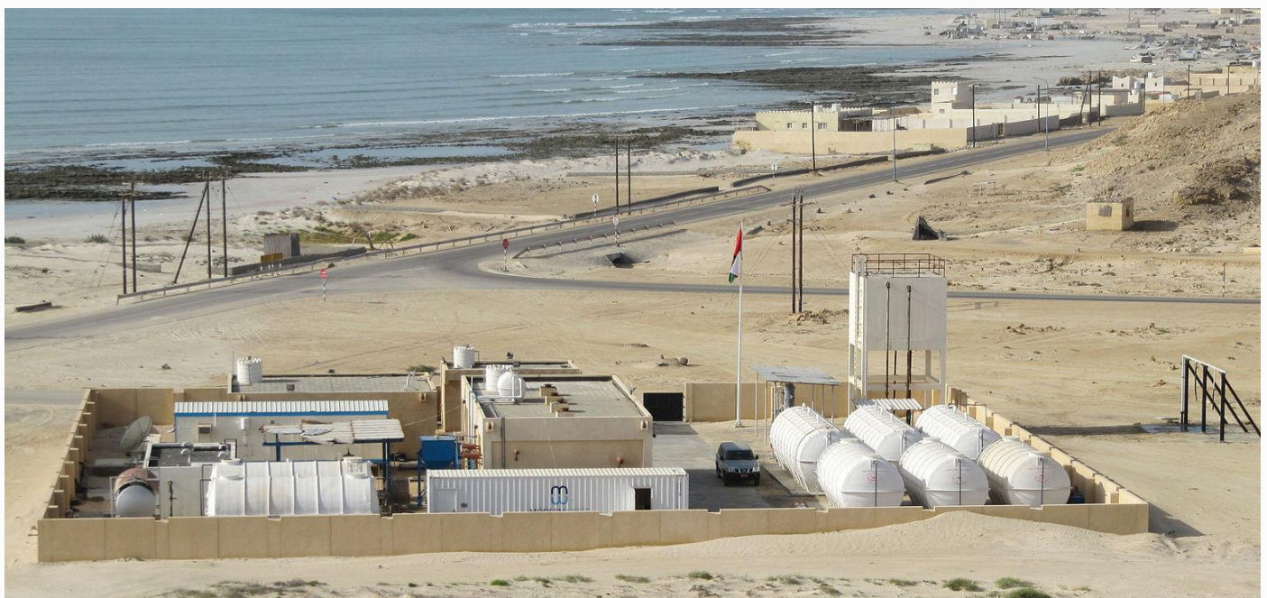
Desalination plant, Oman

The Nile Basin is shared by 11 countries. Stemming from two tributaries—the Blue Nile and the White Nile—the river flows northwards from its origins in the moist East African Highlands to its final stretch through the desert of northern Sudan and Egypt. A treaty signed between Egypt and Sudan in 1959, the Nile Waters Agreement, allocates 55.5 billion cubic meters of water to Egypt and 18.5 to Sudan. Efforts since the 1990s to develop a more comprehensive basin-wide treaty, the Cooperative Framework Agreement, have floundered on the entrenched rift between downstream countries, which maintain their rights based on the principle of historical appropriation, and upstream countries, which call for rights based on equitable utilization. In recent years, tensions have come to a head over Ethiopia’s construction of the Grand Renaissance Dam across the Blue Nile. Egypt and Sudan are concerned about how Ethiopia will fill its reservoir once the dam is complete—the quicker it seeks to do so, the more water it will have to hold back. They are also anxious about what the dam will be used for: If it is used for irrigation as well as hydropower, it could have a major impact on those downstream. Since attempts to find resolution on these points have stalled, much uncertainty remains as work on the dam comes to completion in late 2020.