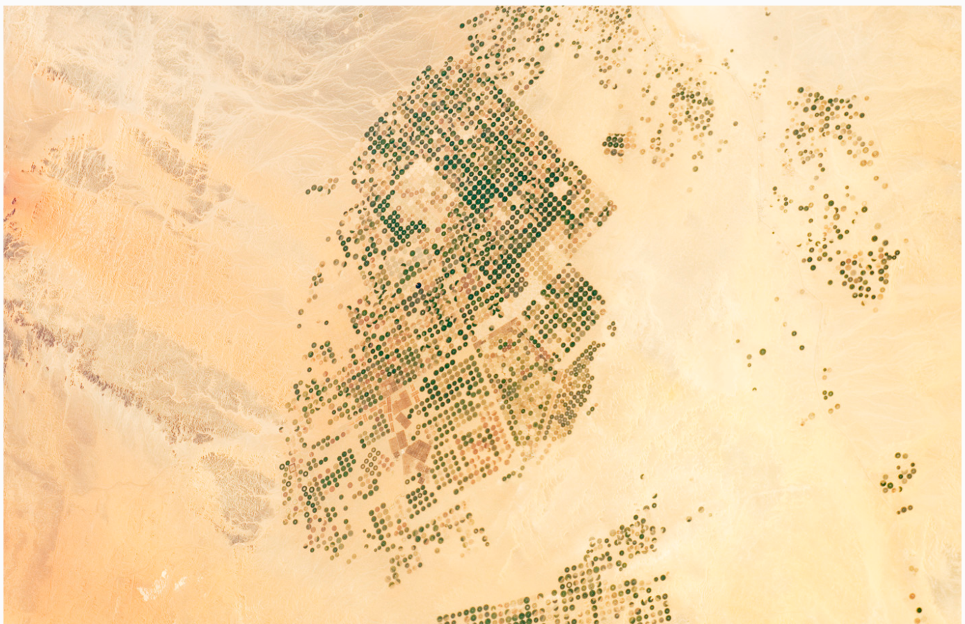
Center-pivot irrigated fields in Wadi al-Sirhan, Saudi Arabia

Virtual water is a concept that has become prominent in discussions of water in the Middle East. The concept refers to the volume of water needed to produce a particular quantity of agricultural commodity. A kilogram of grain, for instance, contains between 1,000 and 2,000 liters of virtual water. Advocates of the concept argue that virtual water can be used as a mechanism for addressing scarcity. By importing virtual water—or more precisely, by importing the agricultural product in which that water is virtually embedded—a country can save the water it would otherwise use to produce that commodity for other purposes. Yet despite the widespread attention it has garnered, this concept has been subject to significant academic critique. A number of scholars have challenged the reductionist nature of the concept of virtual water and its inability to capture the multiple political, economic and environmental factors that shape agricultural production and trade decisions.