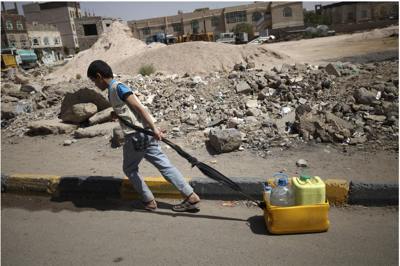
A boy collects water from a faucet in 2015 amid an acute water shortage of clean drinking water in Sanaa, Yemen