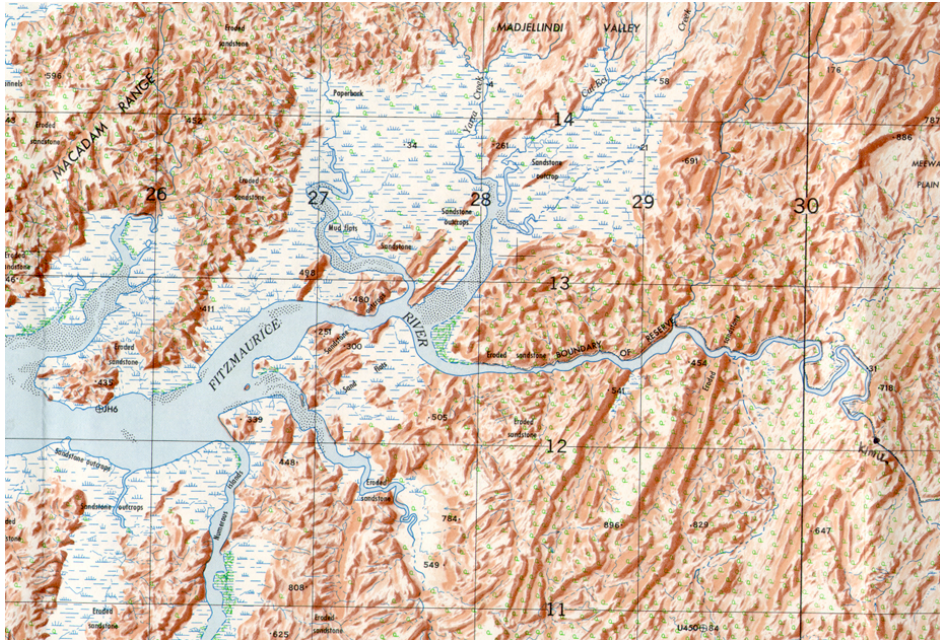
Figure 11.1. Topographic map section of the Fitzmaurice River