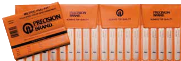
Mfr #09740 Metric Set