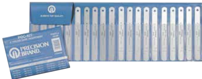
Mfr #19740 SAE Set