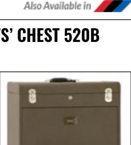
Shown with closed drop front panel