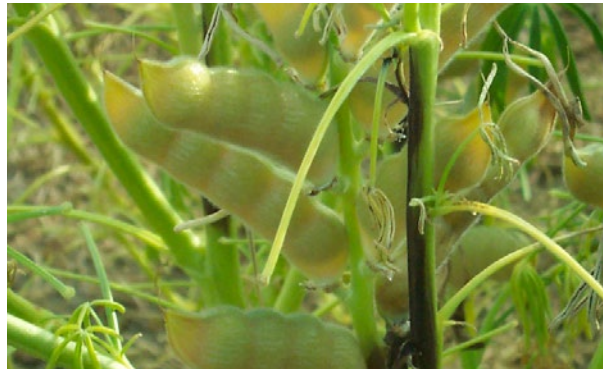
Figure 4: Phomopsis on lupin stem can typically be seen as purple lesions that bleach with age.