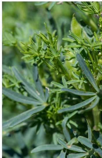
Figure 1: Cucumber mosaic virus is seed and aphid-borne and narrow leafed lupin varieties are more susceptible than albus lines.

GRDC 'Back Pocket Guide Crop Aphids': https://grdc.com.au/CropAphidsBackPocketGuide