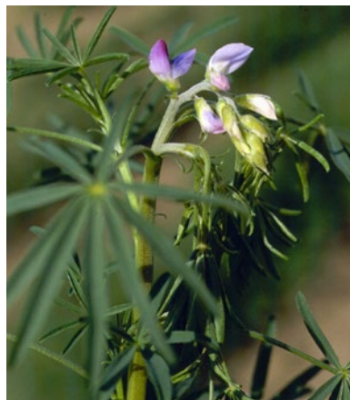
Figure 2: With Bean yellow mosaic virus, the youngest growth of the lupin plant tends to bend over - causing a 'shepherd's crook' appearance.