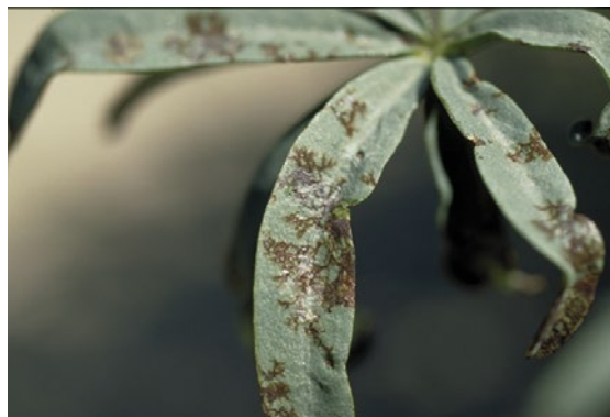
Figure 3: Brown leaf spot can be widespread but is relatively simple to control.