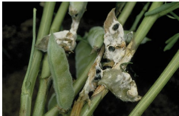
Figure 3: Sclerotinia can affect lupin pods.

DPIRD 'Sclerotinia': https://www.agric.wa.gov.au/lupins/lupin-foliar-diseases-diagnosis-and-management or www.agric.wa.gov.au/mycrop/diagnosing-sclerotinia-collar-rot-narrow-leafed-lupins