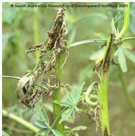
Figure 2: Anthracnose was a severe disease of lupin crops in WA in the 1990s but incidence is now low.