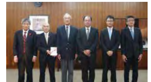
Volunteer welfare council