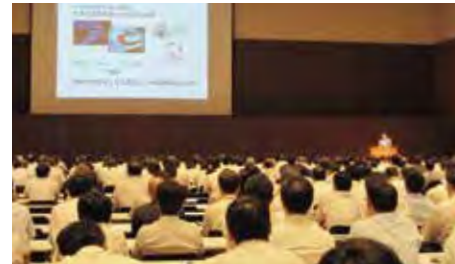
CSR Study Meeting

* AIAG: Automotive Industry Action Group ( https://www.aiag.org/ )