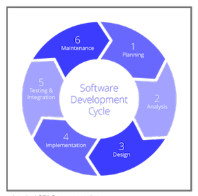
A typical SDLC representation

Overview Almost all modern software is developed in an iterative manner passing through phase to phase, such as identifying customer requirements, implementation and test. These phases are revisited in a cyclic manner throughout the lifetime of the application. A generic Software Development LifeCycle (SDLC) is shown below, and in practice there may be more or less phases according to the processes adopted by the business.