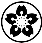
Department Store Icon