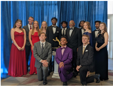
2022 Scholarship Recipients