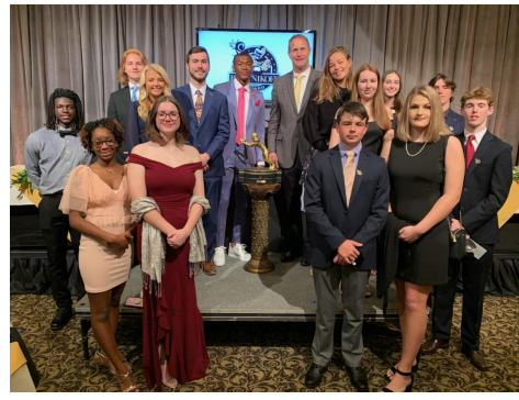
2021 Scholarship Recipients

The name Biletnikoff is synonymous with the term receiver. Fred Biletnikoff, a member of the pro and college football halls of fame, was a consensus All-America receiver at Florida State University and an All-Pro receiver for the Oakland Raiders. He caught 589 passes for 8,974 yards and 76 touchdowns in his 14-year Raiders career from 1965 through 1978. Fred was the Most Valuable Player of Super Bowl XI.