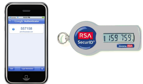
Figure 4.2: The Google Authenticator app is one popular example of a one-time password scheme using pseudorandom functions. Another example is RSA's SecurID token.

Why is this secure? The key to understanding schemes using pseudorandom functions is to imagine what would happen if f_s was be