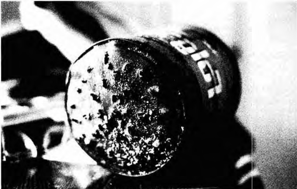
FIGURE 7.—Coffee can with holes punched through the bottom used by Blue Rock to remove larger pieces of nutshell before Stage 2 pounding.

Patrick Bearpaw volunteered that people drive to his house to buy ku-nu-che balls from 50 or 60 miles (up to 100 km) away. Whitekiller and McIntosh have both observed balls in the offices of employees of the Cherokee tribal government and at Cherokee-run hospitals and health clinics. These balls had either been purchased on the premises or were available for purchase if one were to ask. Some