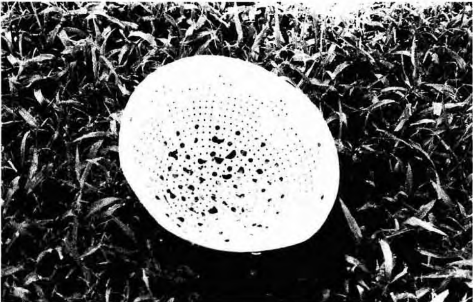
FIGURE 6.—Metal colander used by the Careys to remove larger pieces of nutshell between cracking and pounding.