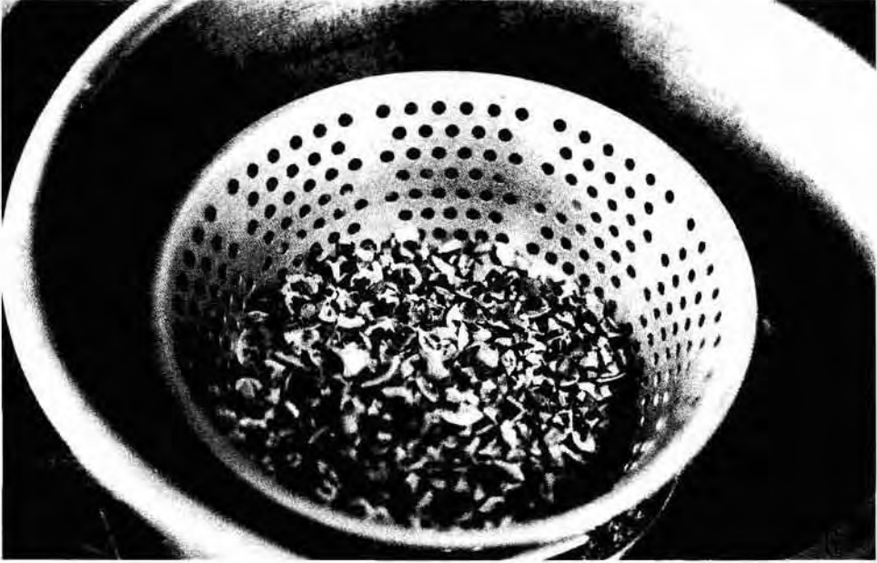
FIGURE 5.—Metal colander used by Nancy Holcomb to sift larger pieces of nutshell after cracking and before pounding.