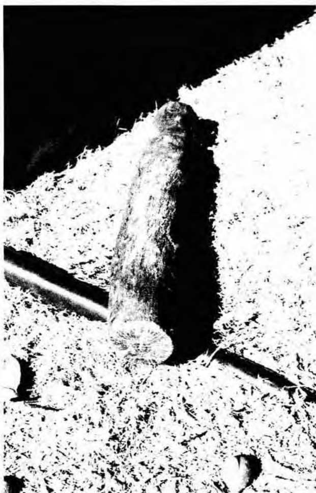
FIGURE 10.—Wooden pestle used by Nancy Holcomb for pounding nuts inside a metal can.

cooks who buy ku-nu-che balls but do not make them themselves, remove the shell fragments after dissolving the ball in hot water. The recipe in Cherokee Cook-lore is also unusual in that it does not specify mixing melted hickory meal with hominy or rice, although it does mention bread or dumplings. Our experiences indicate that contemporary Cherokee cooks in Oklahoma usually use rice, but recognize that cracked hominy would be more traditional. Ramona Carey still prefers hominy, cooking it overnight in her crock pot before preparing ku-nu-che .