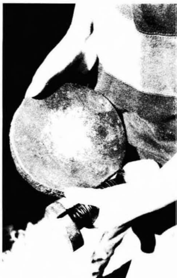
FIGURE 3.—Narcy Holcomb's Stage 1 cracking tools.

"thrifty" trees) are favored by clearing away competitors for sun and root space probably differs little from pre-Contact management practices in the homeland of the Cherokees and other Southeastern tribes. Although hickory trees growing in closed-canopy forests produce fewer nuts that are much harder to gather given the undergrowth and unchecked competition from squirrels (Talalay et al. 1984), some are likely to have been gathered on occasion, especially during hard times. Wilma Mankiller, former Principal Chief of the Cherokee Nation, for example, includes hickory nuts as one type of wild plant food gathered by her large family when she was a child, along with walnuts, wild onions, dandelions, poke, mushrooms, berries, and wild grapes (Mankiller and Wallis 1993:34). She does not specify, however, that the nuts were gathered in the woods.