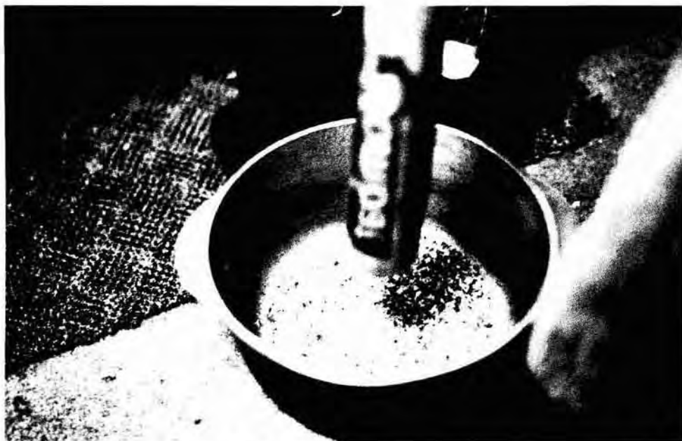
FIGURE 11.—Blue Rock's baseball bat (Bombat SM ) in use as a pestle, pounding cracked and sifted nuts inside a stockpot.

emulsion. Breaking up the lumps with a fork, Mrs. King poured this thick white fluid into a bowl through a standard flour sifter to remove the nutshell, and then added the hickory solution to the hot rice and unabsorbed water. Patrick Bearpaw said that a cloth is used for straining nutshell in his family, and Ramona Carey uses a sifter without a metal stirring apparatus (Figure 12). As the published recipe indicates, degree of thickness is a matter of personal preference.