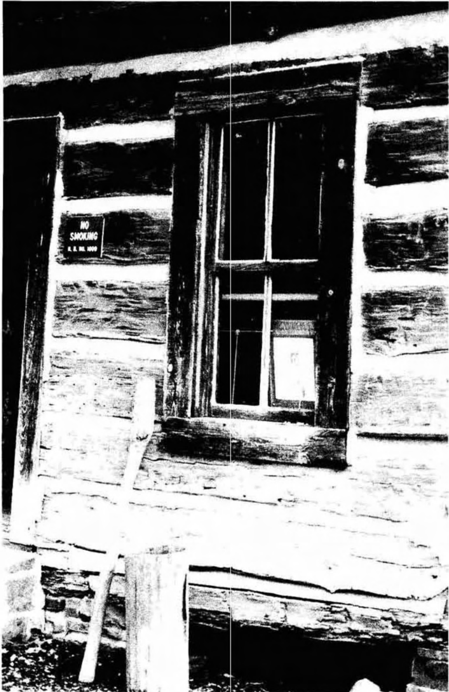
FIGURE 13.—Traditional wooden mortar and pestle on display at Tahlonteskee, near Gore, Oklahoma, capital of the Western Cherokee Nation between 1828 and 1839. The sign in the window shows a Cherokee woman using a mortar and pestle, along with the words “Ga-Na-Ge Ka-No-Na: The big end gives weight to pound corn ( selu ) or hickory nuts ( ga-mu-ge ) in the ( ka-no-na ) or stump.”