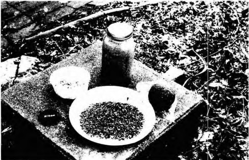
FIGURE 1.—Uncooked ku-nu-che ball on right; nutshell sifted from one cooked ku-nu-che ball in front; undissolved nutmeat sifted from cooked ku-nu-che ball on left; cooked hickory nut soup in jar at rear. Note: one ball mixed with water and hominy or rice fills two or three jars.

Most adults and teenagers, and even many children, who live or grew up as members of a Cherokee community in northeastern Oklahoma are aware of ku-nu-che . They may not eat it often, but it is available at gatherings such as holiday and birthday dinners, church socials, and family reunions. Ku-nu-che is usually distributed in the form of balls (Figure 1), which can be purchased directly from individuals who process the raw nuts. Ku-nu-che balls are also sold at tribal health clinics, community grocery stores, and Cherokee Nation governmental offices. As a friend of one of our consultants said during an interview in Tahlequah, "When