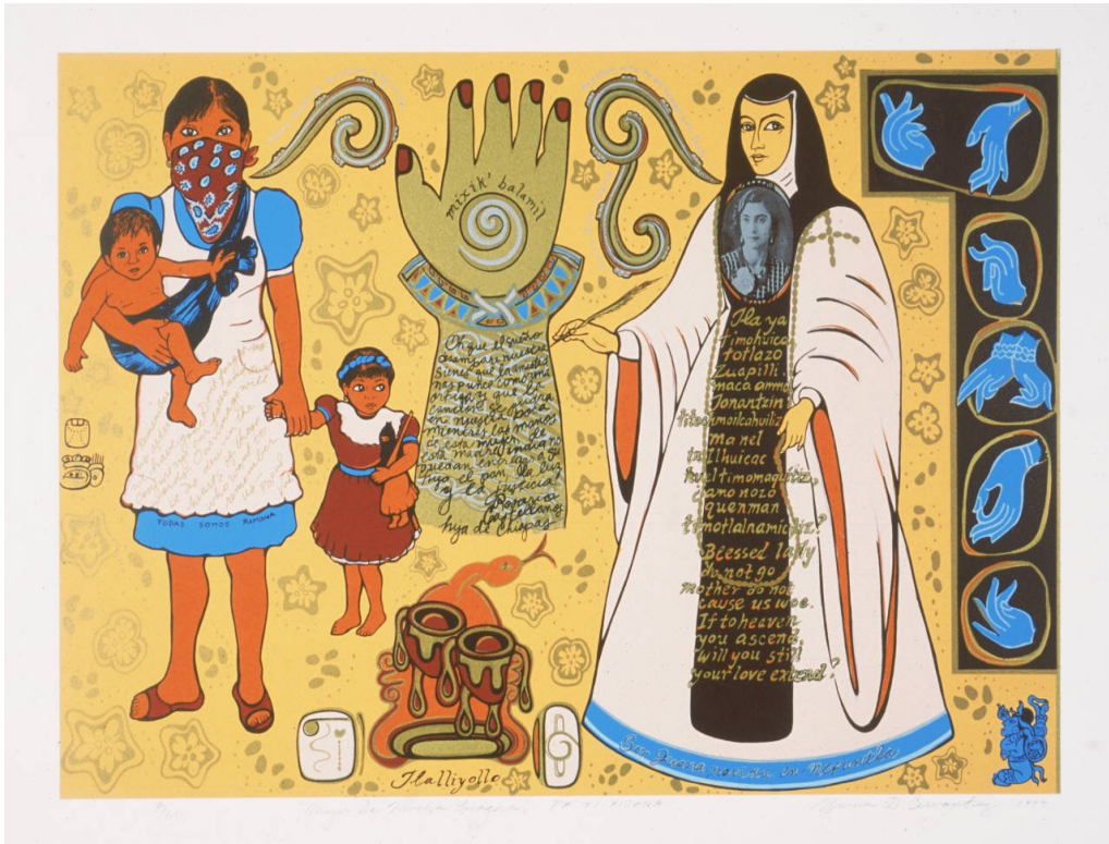
Figure 2: Yreina Cervántez, Mujer de Mucha Enagua, Pa' Ti Chicana (1999)

efforts to sustain the cultural and spiritual heart of their communities. Just as Tonantzin is represented by the double heart between the Zapatista's and Sor Juana's feet, the print undoubtedly suggests that mujeres de mucha enagua / "women with a lot of petticoat," will continue to be the bloodlines that carry on the literal and metaphorical life of decolonial action and aesthetics.