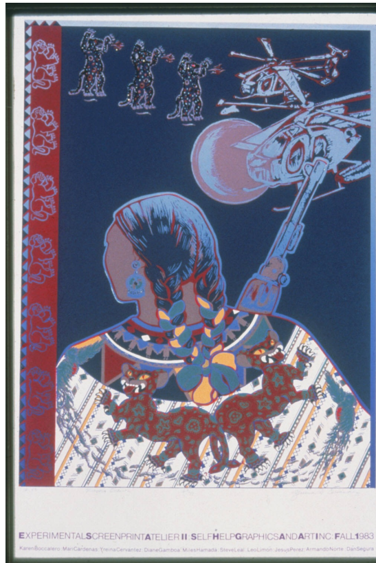
Figure 1: Yreina Cervántez, Victoria Ocelotl (1983)

control, indoctrination and repression” (Doyle 2013).