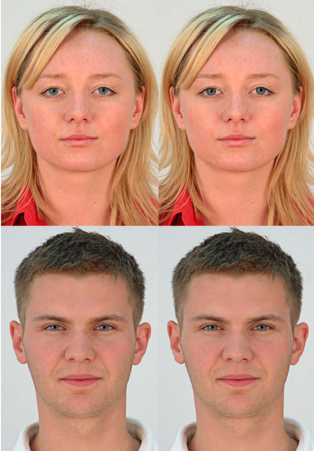
Figure 1. Examples of stimulus pairs, with dark limbal ring faces to the right