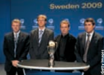
At the final round draw: the representatives of England, Finland, Germany, Spain...