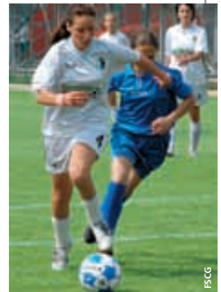
Action from the match between Palma and Sport Uno.

On the subject of the FSCG training centre, we are proud to announce that the new floodlights have been installed around the main pitch and that they will be used for the first time at the final of the national Under-19 cup in a couple of weeks' time. ■