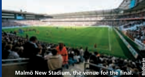
Malmö New Stadium, the venue for the final.