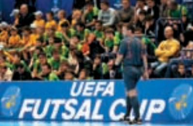
The public turned out in force to watch the final round.