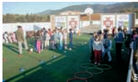
Practising on the mini-pitches.

Mention should also be made of the support from our sponsor, BES, which has invested in the construction of 13 mini-pitches and intends to continue in 2010, with a new facility already having been allocated. We hope that, in the context of social responsibility, other sponsors will join this programme. ■