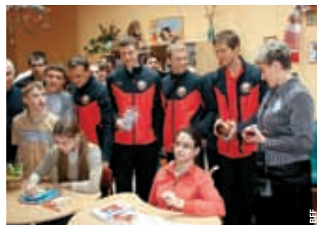
The visit brought a smile to the faces of the youngsters at this rehabilitation centre.