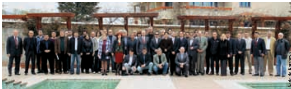
The seminar on medicine and football.