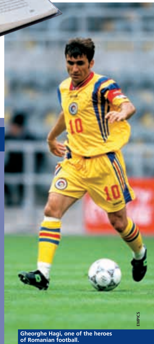
Gheorghe Hagi, one of the heroes of Romanian football.