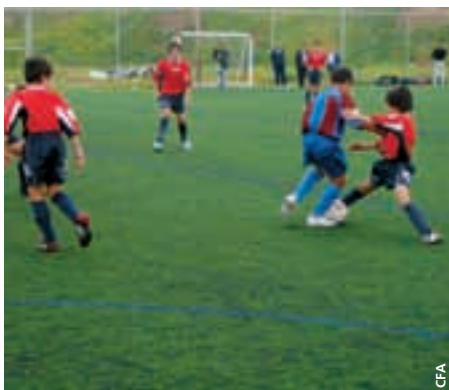
The youth competitions are still in full swing.

Apoel, with the title already under their belts, can now fully turn their attention to overturning their 2-0 deficit in the Cypriot Cup semi-final at home to APOP/Kinyras Peyias FC on 6 May. On the same day,