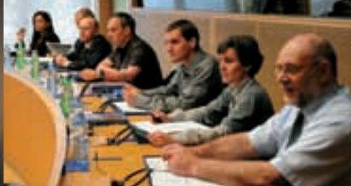
... working meeting at the House of European football in Nyon.