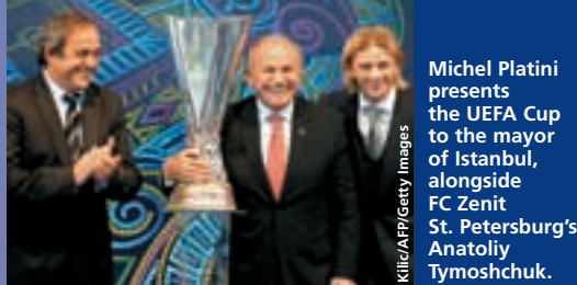
Michel Platini presents the UEFA Cup to the mayor of Istanbul, alongside FC Zenit St. Petersburg's Anatoliy Tymoshchuk.

As half of the faces in the European Parliament are expected to be new after the ballots in June, UEFA will have to resume its efforts to establish a group of natural allies within the institution and identify new discussion partners that are receptive to the idea of good football governance for the future.