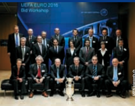
Representatives of the bidders with the Henri Delaunay trophy.