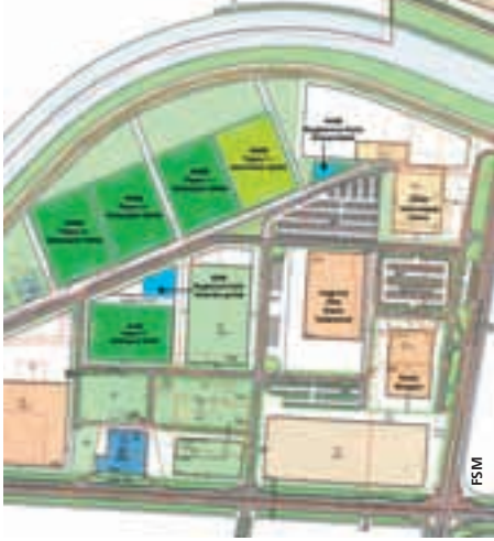
The plan of the new training centre.

There will be a kit building, mini-hotel, spa centre, etc.