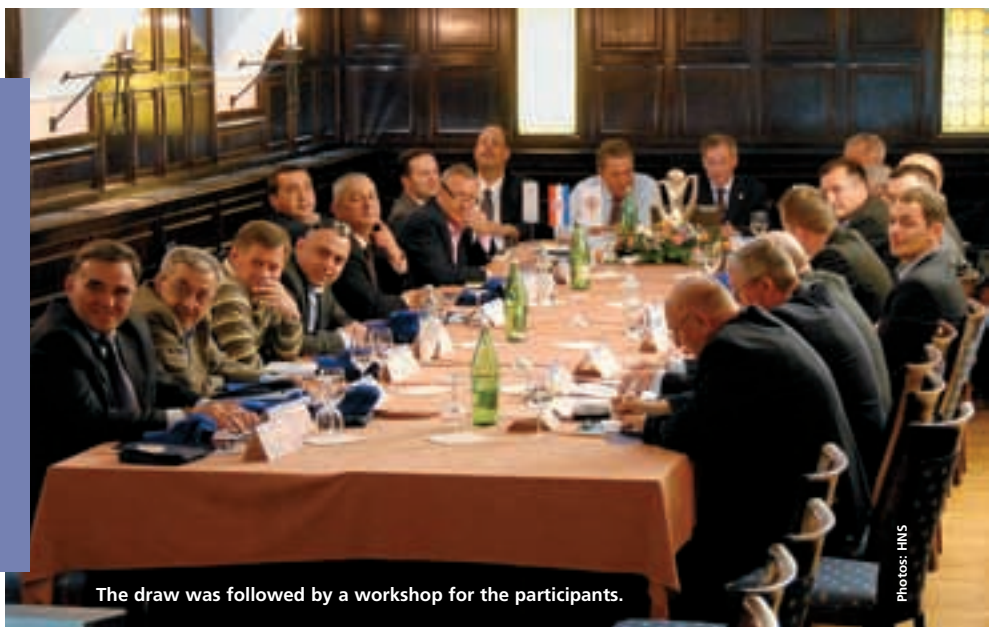
The draw was followed by a workshop for the participants.