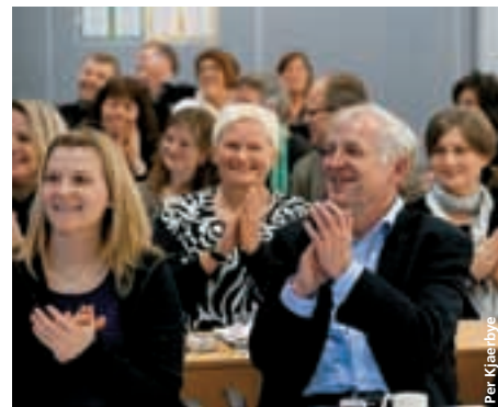
A conference to encourage more women into football administration.

tion in Norway. The conference also produced many discussions and constructive debates about how to get more women interested in football, not only as players, but also to influence the development of Denmark's favourite sport. ■