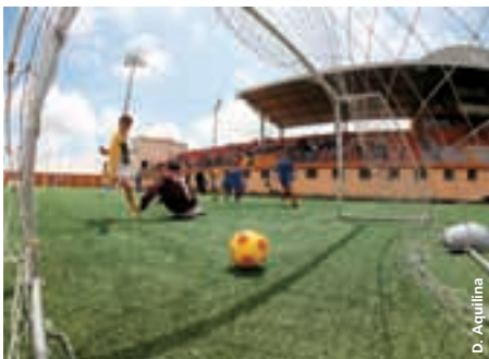
The school futsal festival was a great success.

The recently set up regions project for nurseries, which is aimed at coordinating the development work of these establishments in various parts of the country, is reaping the desired results in that talent is being identified and monitored on a national scale.