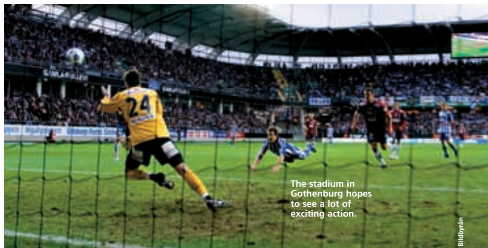
The stadium in Gothenburg hopes to see a lot of exciting action.