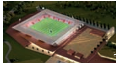
A scale model of the new national stadium.

■ Work on the new stadium, which will meet all FIFA and UEFA requirements for international matches, is expected to begin in 2011. ■