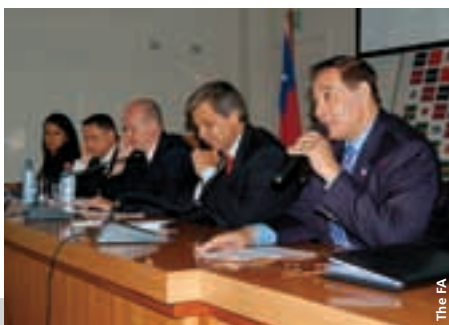
The course run by The FA in Chile.

The Respect seminar is the third course to be delivered by The FA in South America this year as part of its commitment to CONMEBOL to assist the development of football in South America. ■