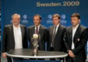
... Sweden, Italy, Belarus and Serbia.