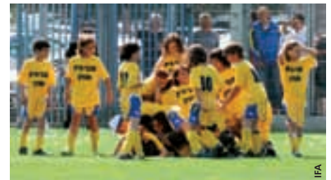
The children's football festival was enjoyed by all.

At the end of May, at the Ramat Gan national stadium, the IFA will for the first time hold all the finals – in five age groups – in succession, at a festive event for children and families that will be open to the general public.