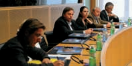
The local organising committee at a...