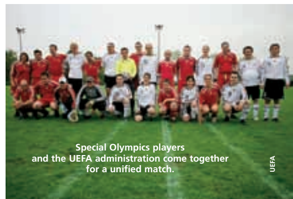
Special Olympics players and the UEFA administration come together for a unified match.

The group matches will be contested from 13 to 19 July, with the semi-finals on 22 July and the final on 25 July.