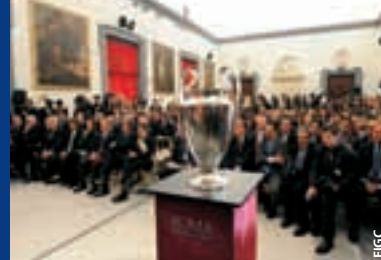
The cup handover ceremony in Rome.