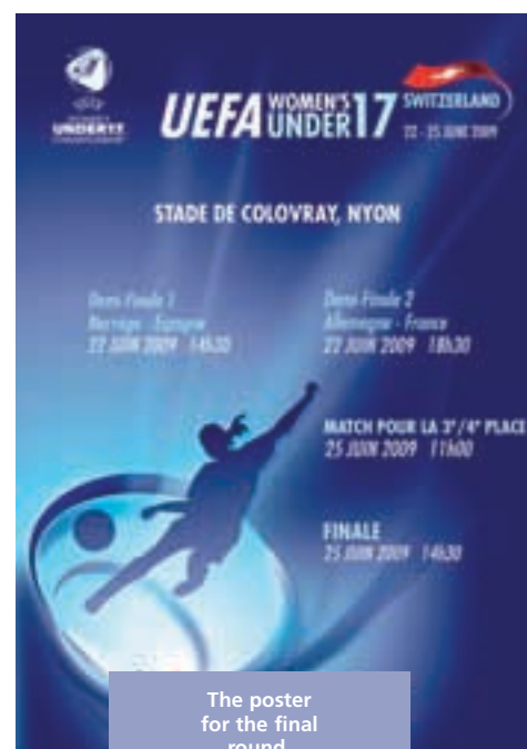
The poster for the final round.

Excitement on and off the field is guaranteed and the second semi-final, featuring last year's finalists, will certainly be a highlight of this final round.