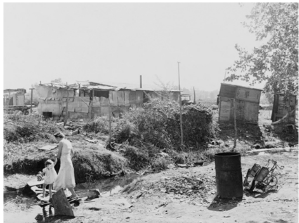
Figure 1 Ditchbank settlements in California (1936) 6