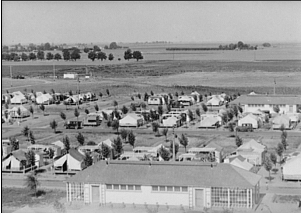
Figure 2 An aerial view of the FSA camp for migrant workers at Shafter, California (1938) 7