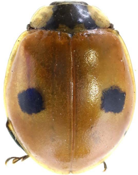
Fig. 3. Adalia bipunctata (Linneus, 1758) – The Latvian national insect.

For Latgale craftswomen ladybirds were known as positive insects and therefore they were symbolically depicted also in towel design. Ladybird Adalia bipunctata (Coleoptera: Coccinellidae) (Fig. 3) is a Latvian national