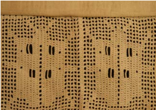
Fig. 2. The entomomorphic ladybird-like element on the edge of towel lace. Krāslava district, Kombuļi civil parish, Skadiņi. Author: Albīna Plinta (70ies of the 20th century).

The beetle ornament in the crocheted towel lace is a stylized ladybird. The ladybird has two large and two small spots on each elytron,