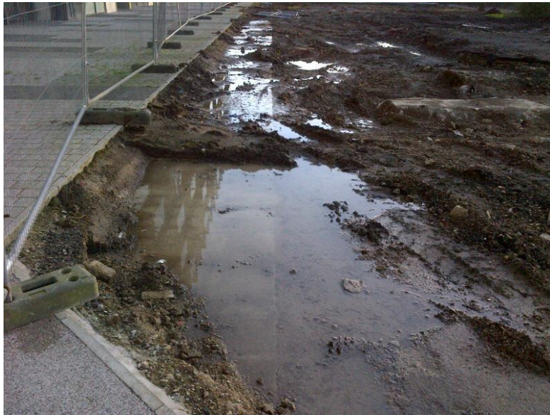
Water collecting on the exposed concrete slab of the underground car park.

system (which the contractor is producing an estimate for) whilst we seek legal advice.