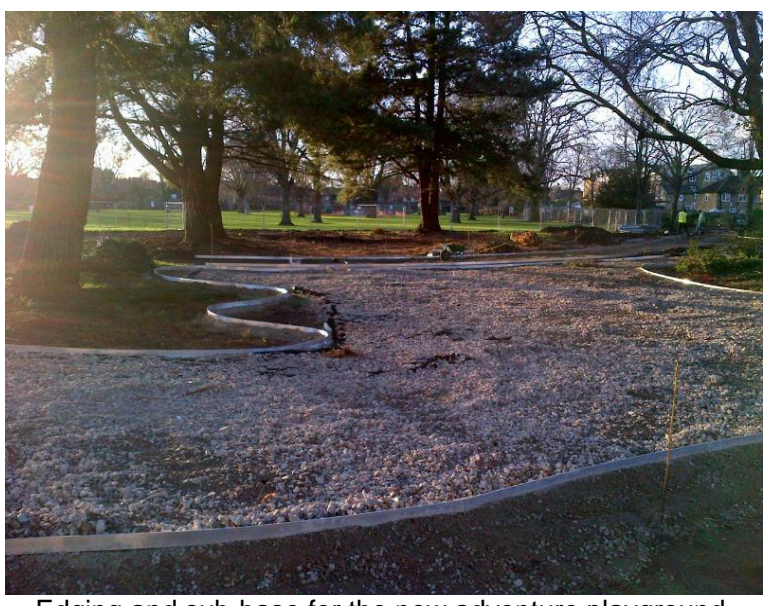
Edging and sub-base for the new adventure playground.