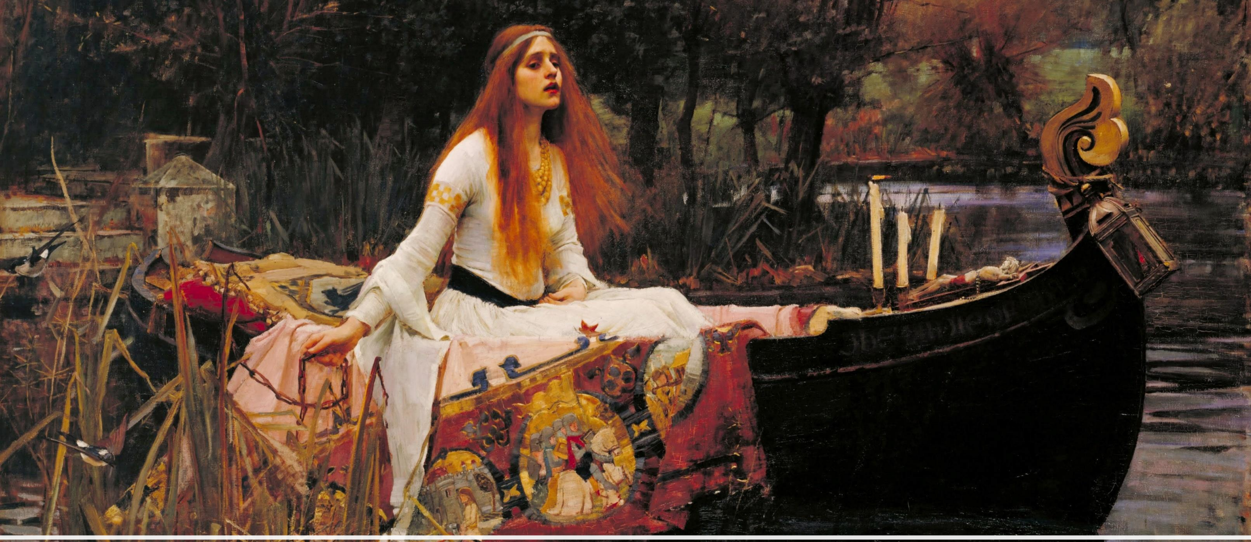
The Lady of Shalott