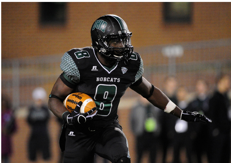
Former Ohio running back Donte' Harden racked up 322 yards of total offense (184 yards rushing, 75 yards receiving and 63 return yards) in front of a national television audience on ESPN as the Bobcats posted a thrilling 35-31 victory over Temple inside Peden Stadium.