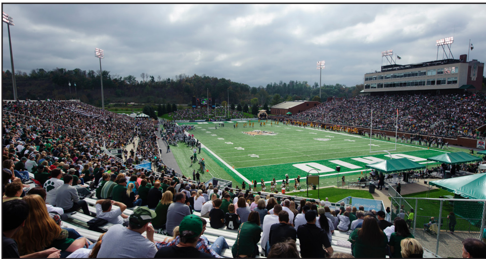
A school-record crowd of 25,893 packed Peden Stadium on Sept. 8, 2012 to watch the Bobcats in their home-opener against New Mexico State. The Bobcats defeated the Aggies 51-24. The week before, Ohio defeated Penn State 24-14 to open the 2012