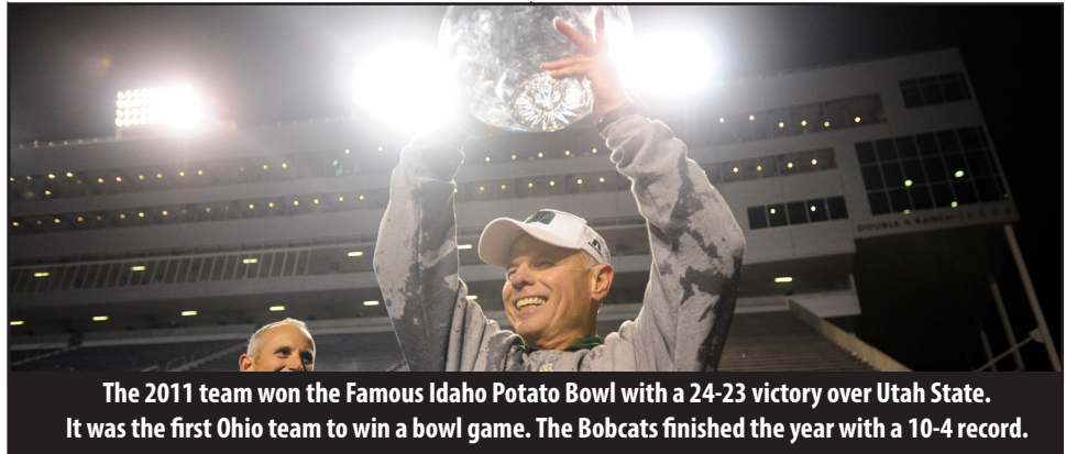
The 2011 team won the Famous Idaho Potato Bowl with a 24-23 victory over Utah State. It was the first Ohio team to win a bowl game. The Bobcats finished the year with a 10-4 record.