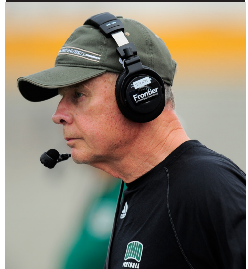
Frank Solich has guided Ohio to the first four bowl wins in program history during his tenure as head coach of the Bobcats.