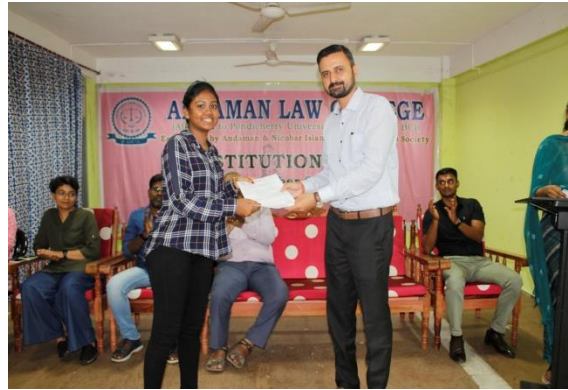
Former Principal (i/c) distributing letter of admission to the student during counselling