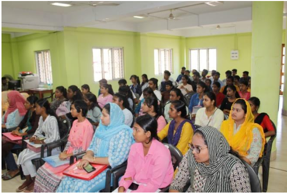
Counselling for admission to Academic Year 2023-24