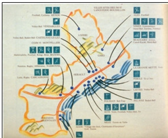
Les 19 villes sites des JM Languedoc-Roussillon 1993