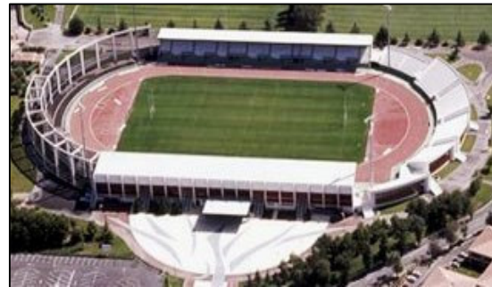
Le Parc des Sports et de l'Amitié à Narbonne