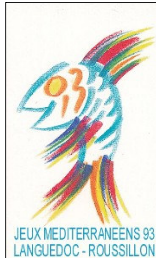
La "rascasse", Mascotte des Jeux