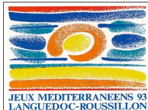
Affiche officielle des JM Languedoc-Roussillon 1993