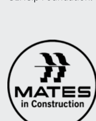
(Source: MATES in Construction New Zealand: Industry Wellbeing Environmental Scan and Survey; OzHelp Foundation: National Tradie Wellbeing Survey Results January 2022)

If you have a workmate who is finding it tough to cope, help is always available through the MATES in Construction website or phone 0800 111 315.