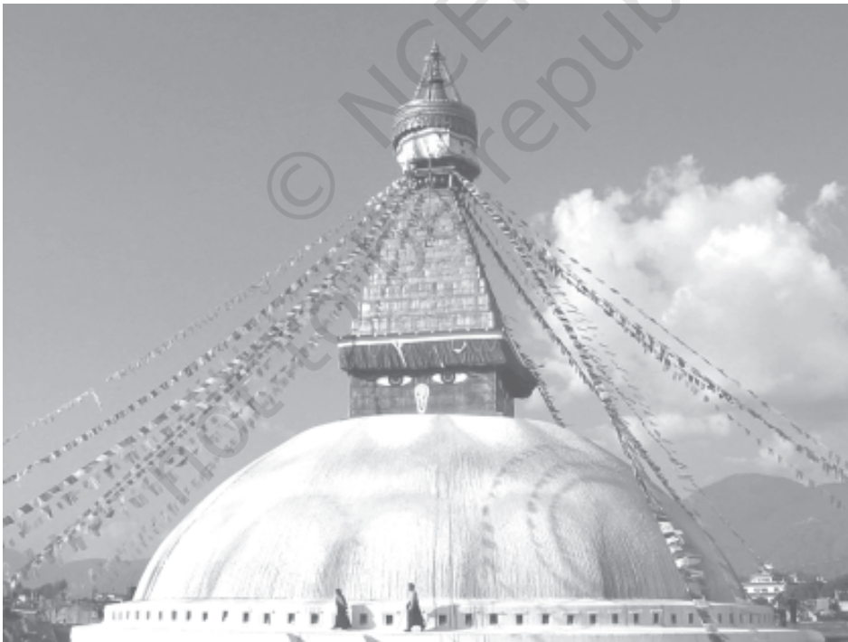
The Baudhnath Stupa, Kathmandu