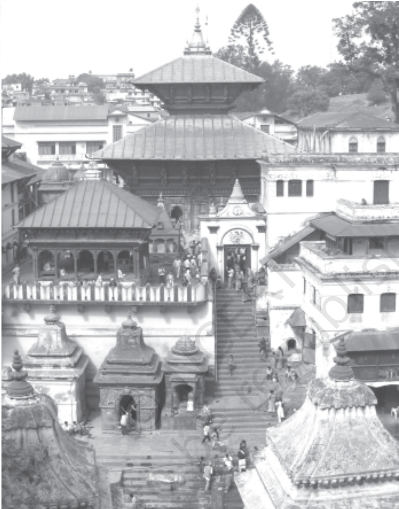
Pashupatinath Temple, Kathmandu

that flows below. A corpse is being cremated on its banks; washerwomen are at their work and children bathe. From a balcony a basket of flowers and leaves, old offerings now wilted, is dropped into the river. A small shrine half protrudes from the stone platform on the river bank. When it emerges fully, the goddess inside will escape, and the evil period of the Kaliyug will end on earth.