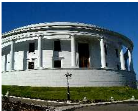
Below: The Centre for the Study of the Texts

To mark the opening of the Terraces, an oratorio and a symphony have been composed, respectively, by Norwegian composer Lasse Thoresen and Tajik composer Tolib Shahidi. The Israel Northern Symphony, Haifa, under the direction of Stanley Sperber, will accompany acclaimed instrumental and vocal soloists from Canada, Austria, and the United States, backed by the Transylvania State Choir from Cluj, Romania. The original orchestral works will climax with the spectacular inaugural lighting of the Terraces, building light upon light like strings of pearls draped around the illumined Shrine.