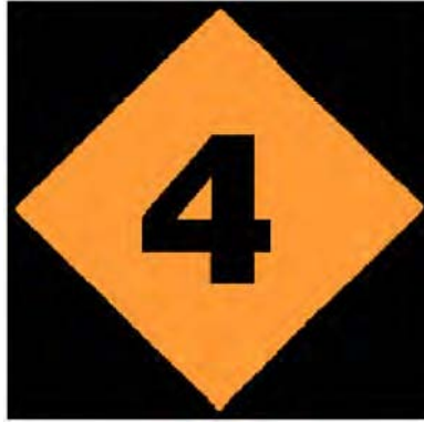
Fig 1 Hazard Division 1.4 Sign

3.3.2 Subject to the provisions of para 3.2.1 cadet units are permitted to store ammunition in approved mini armouries, security lockable authorised containers within a weatherproof room that is used for other purposes. The room is to be free from appreciable fire risk. Security standards are given in JSP 440 Chap 4 Part 7, Section 7 and the single service regulations: