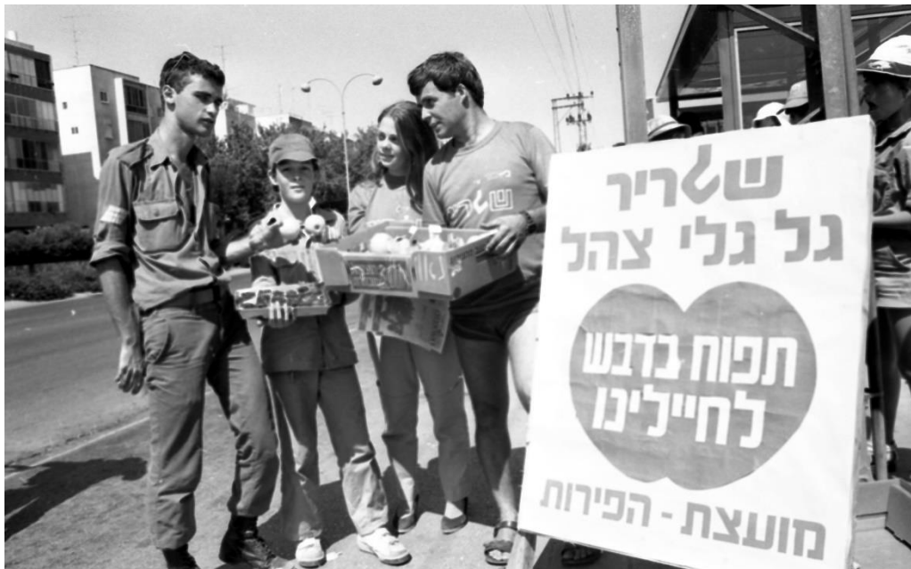
Giving Apples to Soldiers for Rosh Hashanah, 1984