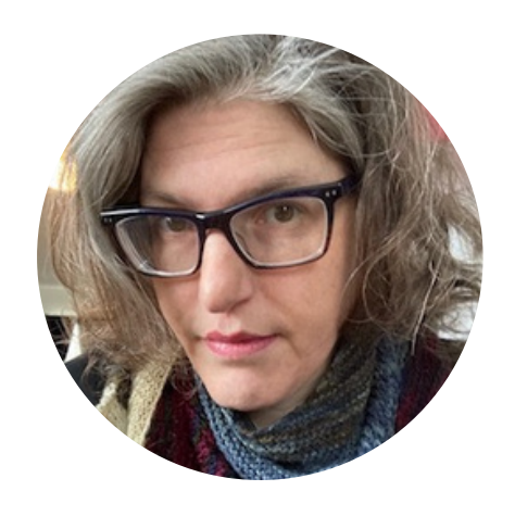
Laura Crossett Communications