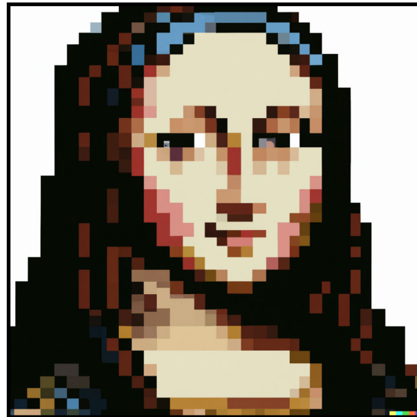
✓ “A Pixel Art of the Mona Lisa Face.”