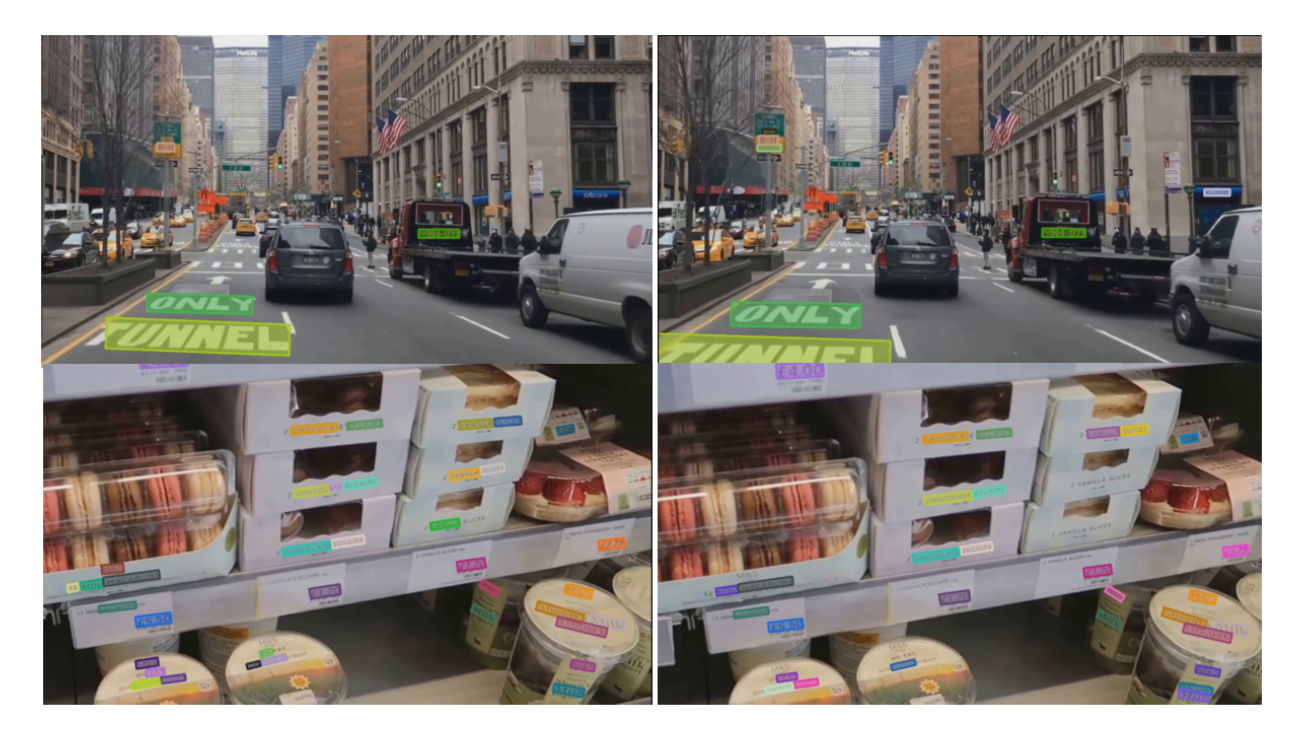
Figure 3: The visualization of detection and tracking results in driving and indoor street scenarios