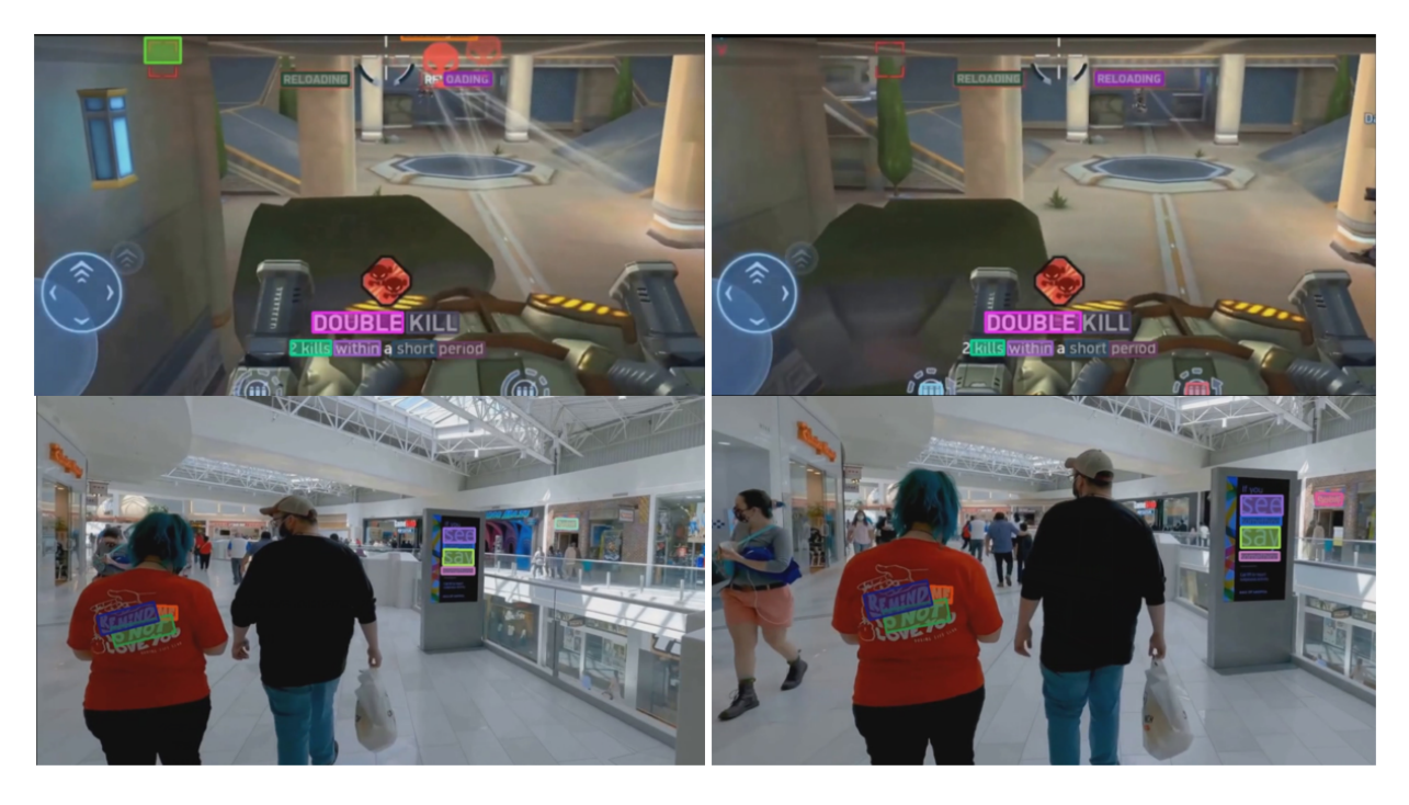
Figure 2: The visualization of detection and tracking results in game and activity scenarios