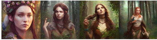
(a) Stable Diffusion