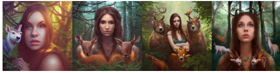
(b) AltDiffusion EN