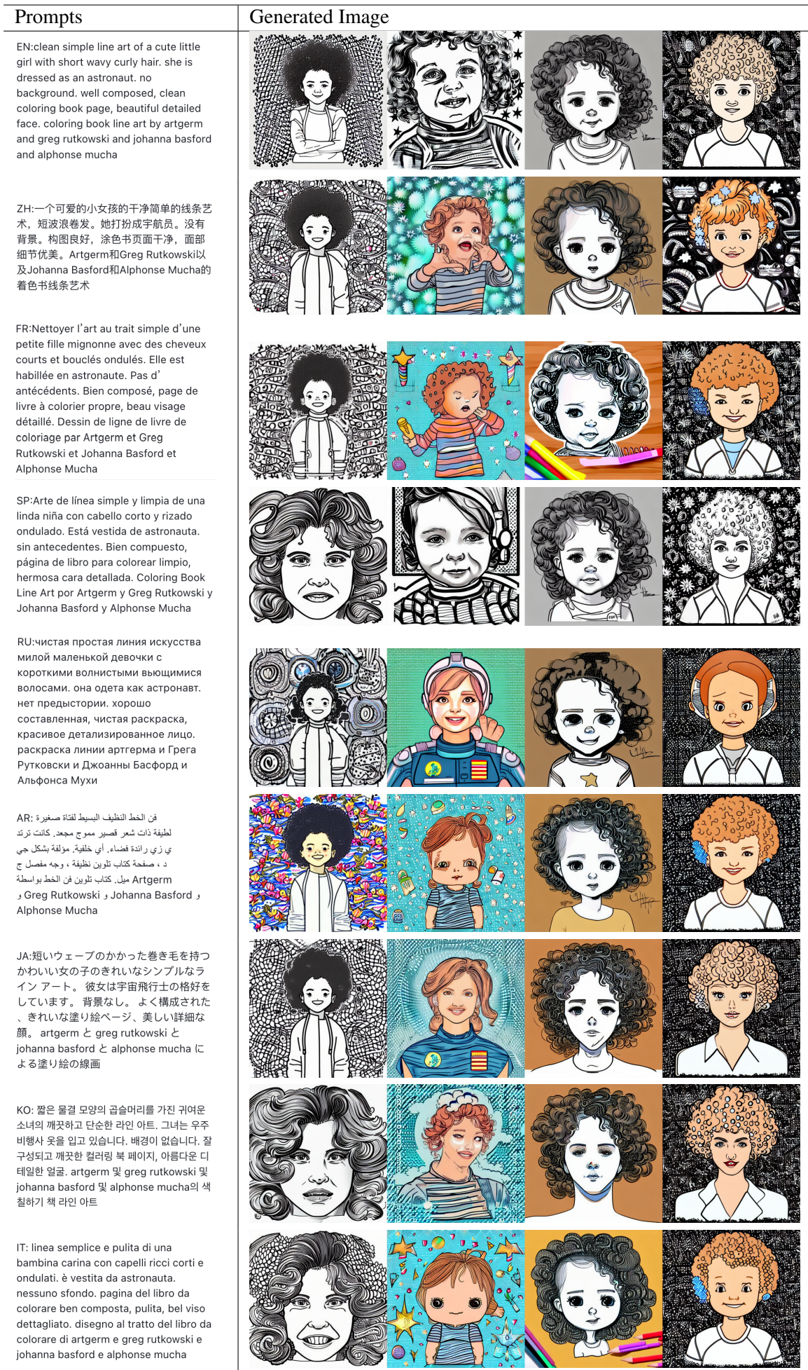
Table 5: The images generated by AltDiffusion M9 with the same prompt translated to nine languages and a fixed seed.