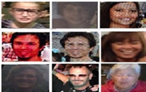
Fig. 2. Some of the successfully classified challenging images from the Adience database

Fig.2 shows some of the images of the Adience database. Although these are very challenging images having blur, poor lighting, low-resolution, motion, pose, and facial expressions, they all are classified correctly using the proposed work.