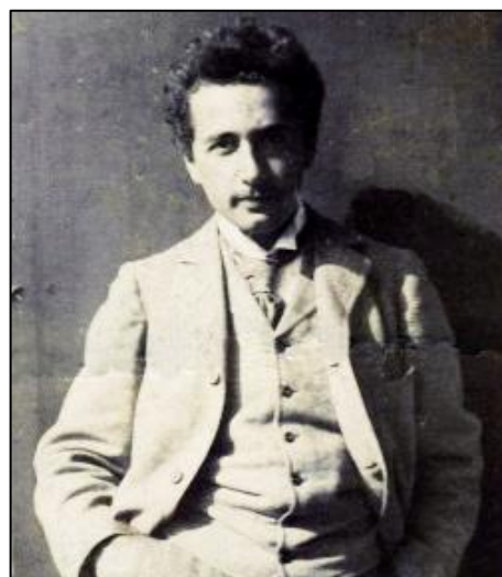
Fig. 2 Einstein at Zurich Polytechnic.

https://en.wikipedia.org/wiki/Mileva_Mari%C4%87