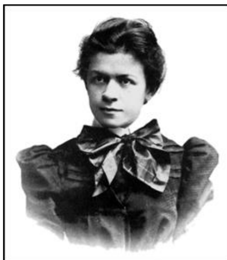
Fig. 1 Mileva Marić. Circa 1896.

In September 1896, Einstein passed the Matura-Exam with reasonably good grades, including a perfect mark of 6 in physics and mathematics on a scale of 1–6. Although he was only 17, this young man enrolled in the four-year mathematics and physics teaching diploma program at the Swiss Federal Polytechnic [16].