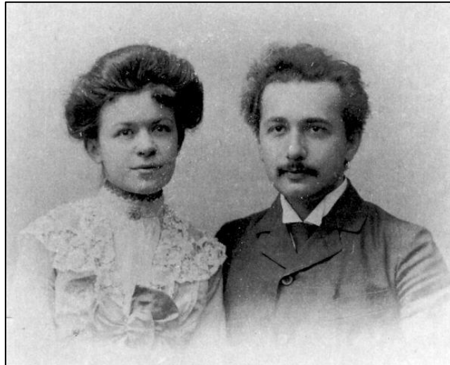
Fig. 4 Mileva and Albert Einstein on their wedding day.