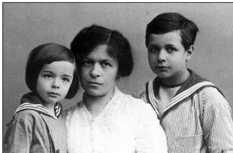
Fig. 6 Tete, Mileva, and Hans Albert.

Einstein was a celebrity and travelled around Europe giving lectures and enjoying his newfound fame. All the while his wife stayed in Prague, a city she hated. Mileva was depressed for not being part of scientific academia, as she had dreamt, and for having to spend most days alone with the children. Einstein started to resent his wife's demands for attention, for he was far too busy to occupy himself with family life [16].