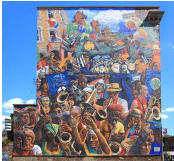
1985 'Hackney Peace Carnival Mural' by Ray Walker shows the Peace Carnival of 1983 and is one of London's best preserved murals.