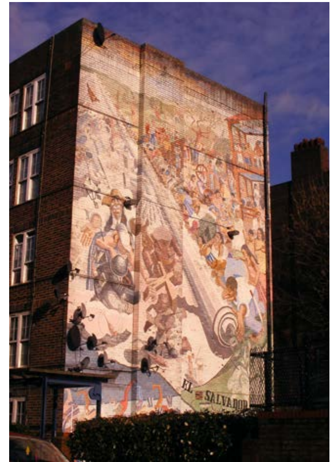
1985 'Changing the Picture' shows the people of EL Salvador rolling scenes of war away under a new image of peace. This mural was commissioned by the Cultural Commission of El Salvador Solidarity Campaign.

art.tfl.gov.uk Twitter: @aotulondon Instagram: @artontheunderground