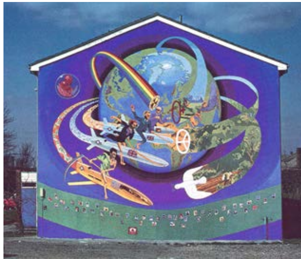
1983 'Riders of the Apocalypse' by Brian Barnes was painted during the GLC's Peace Year. Based on the film 'Dr Strangelove', the mural shows political leaders racing around the earth on rockets about to collide with various symbols of peace.