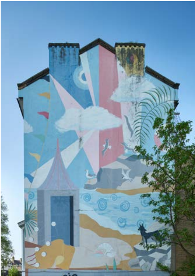
Bellefields Road Mural #2, 1988 London Wall Mural Group, Eugene Palmer, John Seward and local residents Bellefields Road

For the second Bellefields Road mural, the London Wall Mural Group spent months working with local residents to choose a design and colour scheme that complemented the first mural. Together they produced an image depicting a fantasy seascape. This beach scene includes shells, seagulls and crashing waves, as well as other unusual additions, including a winged black dog holding an olive branch and a psychedelic pink and yellow sunset. The top