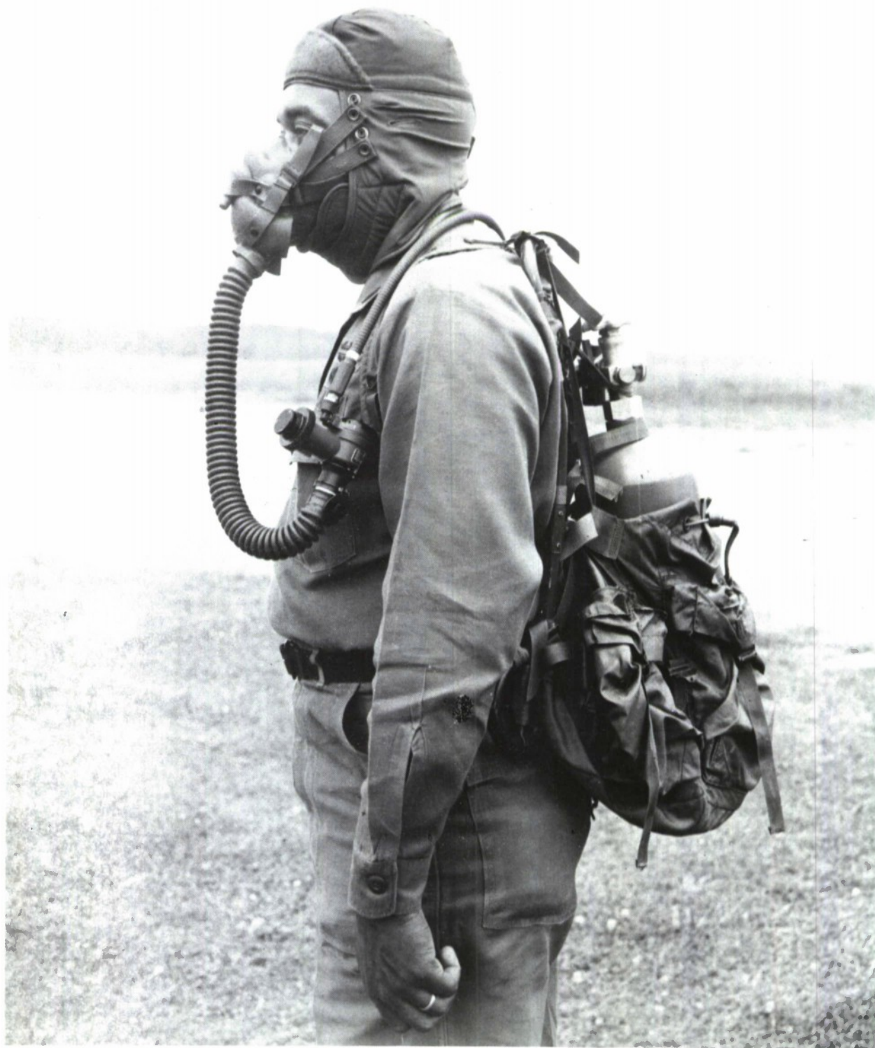
FIGURE 3. OXYGEN BREATHING SYSTEM