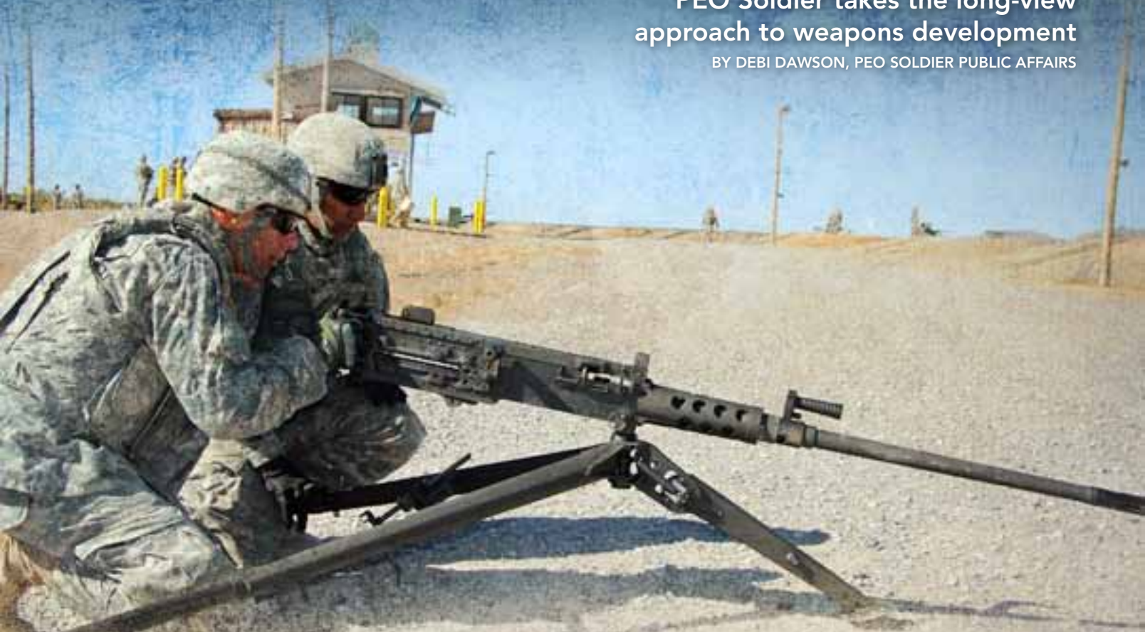
Soldiers train on a new M2A1 .50 Caliber Machine Gun mounted on a new M205 Lightweight Tripod at Fort Bliss, Texas. The M2A1 includes modern features and design improvements that make it easier and safer to use.

BY DEBI DAWSON, PEO SOLDIER PUBLIC AFFAIRS