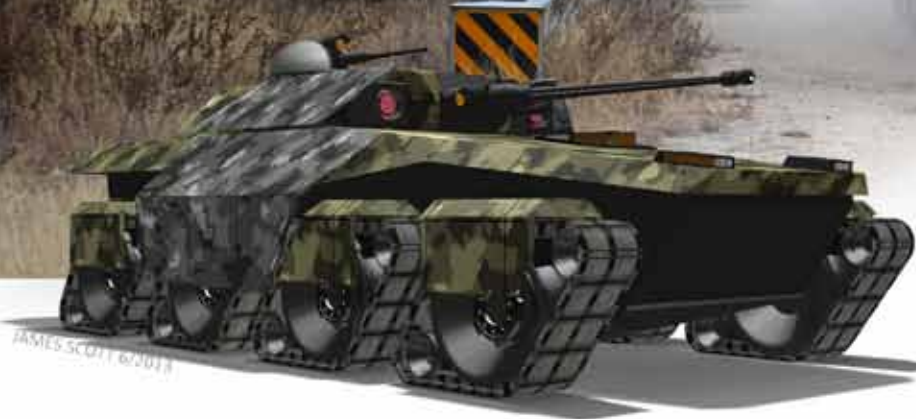
Above: The first three optionally-manned vehicles negotiate oncoming traffic, follow rules of the road, recognize and avoid pedestrians and obstacles, and then use intelligence and decision-making abilities to reroute direction through a maze of test areas to complete both complex urban and rural line haul missions using the Autonomous Mobility Applique System.