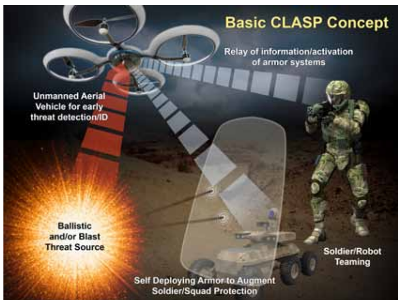
A conceptual protective robotic system: (U.S. Army illustration by Eric Wall)

"A great thing about working in the Army lab is that we have a lot of smart people with open minds working in different areas. If you discover or invent something revolutionary that may be big payoff, it won't be tossed aside just because it is different than how the Army fights today. For a scientist who wants to have an impact, that keeps you pretty excited," Baker said. ■