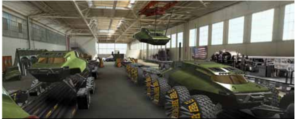
This artist rendering depicts a future combat vehicle assembly line at Detroit Arsenal. High-mobility ground combat vehicles capable of tackling any terrain or environmental condition (track or wheeled) are being "conceived" by TARDEC systems engineers. (U.S. Army illustration by James Scott)

"It's all conceptual," TARDEC engineer David Skalny said. "The propulsion unit doesn't change. We're looking at a standard unit length for the chassis and you could put together whichever pods you need to achieve