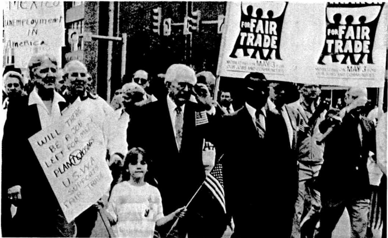
Sen. Howard Metzenbaum leads Ohio rank-and-file march for fair trade legislation and plant closing protections.

year period. If an agreement were reached with a country, possible retaliatory action against unfair trade practices would be suspended. However, in either case the measures for compliance would increase U.S. exports to that country. Offered by Senate leaders Robert Byrd (D-W.Va.) and Bob Dole (R-Kan.), the adoption of the Riegle-Danforth proposal was approved by an overwhelming 87-7 vote on July 10. Later the Senate approved the omnibus trade bill.