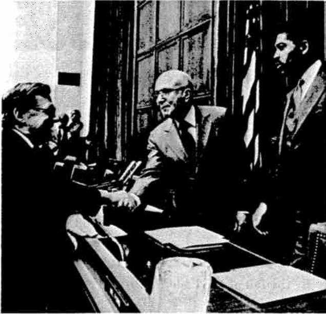
AFL-CIO President Lane Kirkland confers on strategy with two staunch allies of labor—Rep. Augustus Hawkins (D-Calif.), chairman of the House Education & Labor Committee, and Rep. William Clay (D-Mo.).

sponsored by passing specific legislation to deal with an economic sector badly battered by the flood of low-wage imports—the textile and apparel industry. Despite 1974 international trade agreements to provide for the orderly growth of textile and apparel imports, these imports mushroomed from 12 percent of the U.S. market in the early 1970s to nearly 50 percent by 1987. The result: over 300,000 jobless American textile workers.