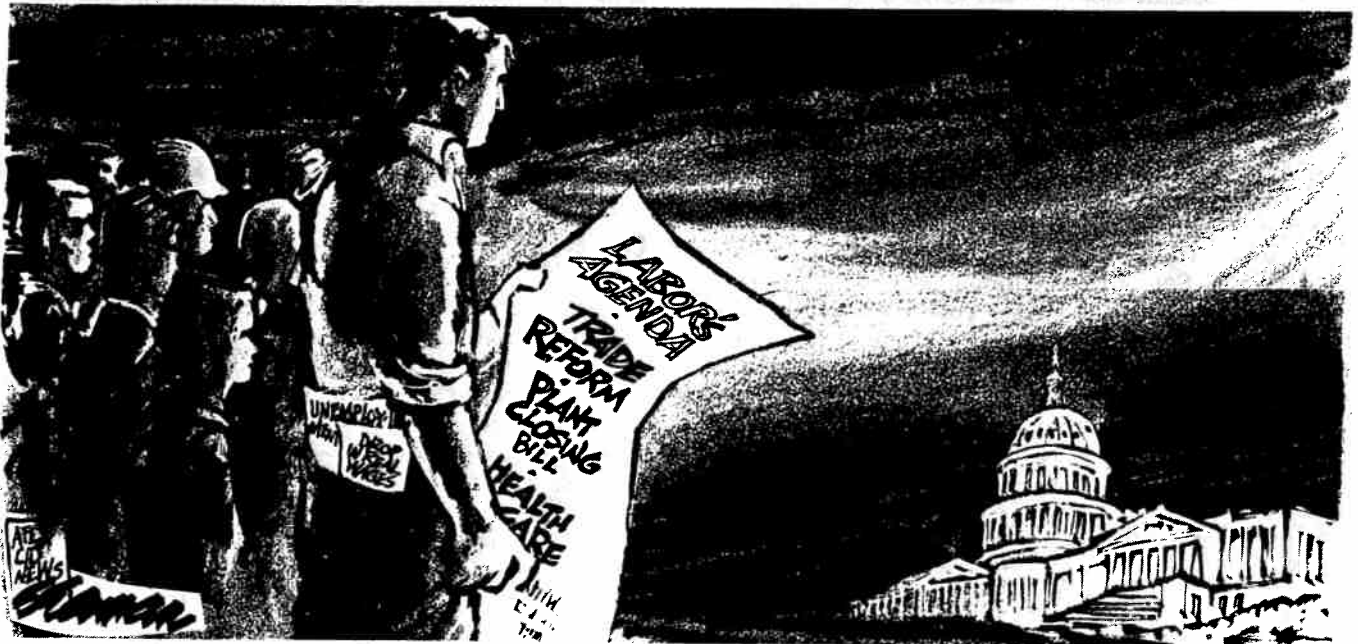
Watch on the Potomac -- 1988

AFL-CIO Department of Legislation 815 16th Street, N.W. Room 309 Washington, D.C. 20006