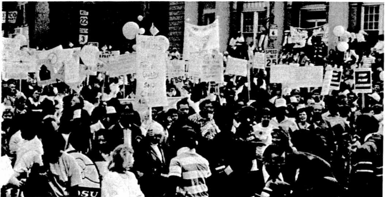
Grassroots message is sent to Capitol Hill by Cincinnati union members rallying in import-battered Norwood, Ohio, in support of strong trade legislation.

During the 100th Congress the continued public outcry over record-level U.S. trade deficits and the loss of American jobs to imports kept the trade issue at political center stage. The House re-