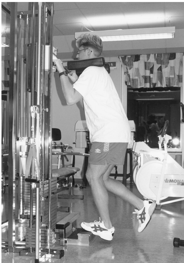
Figure 3. Increasing the load by adding weight with a weight machine.

between the different testing periods for the injured side. A P value of less than 0.05 was considered significant.