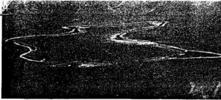
Figure 1. Atoll Diego Garcia