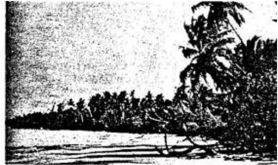
Figure 2. Typical Atoll Lagoon Beach