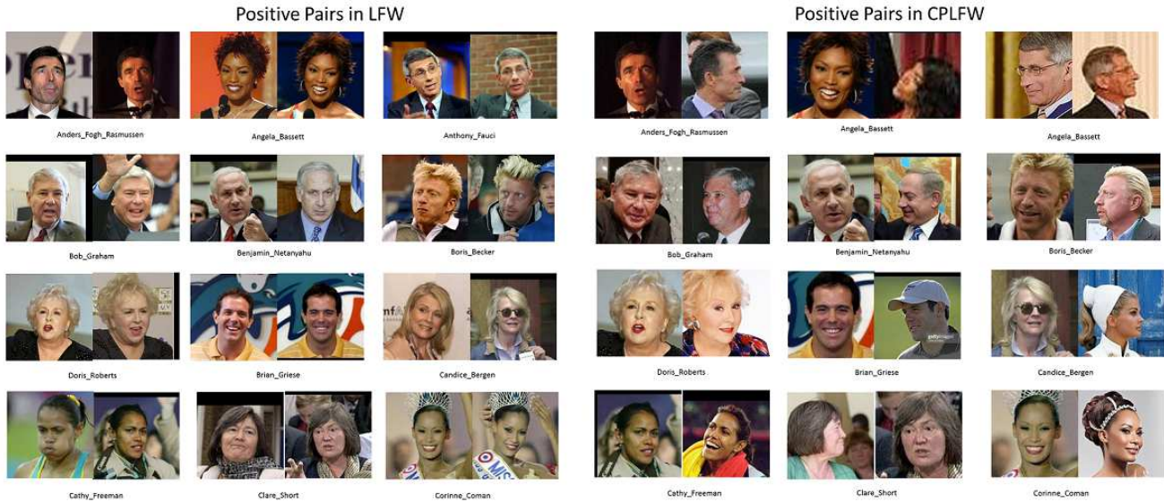
Figure 2. The comparison of positive pairs in LFW and CPLFW. Compared to LFW, the positive pairs in CPLFW contain obvious pose difference.