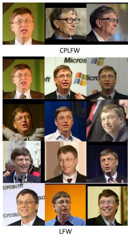
Figure 1. Comparison of the same individual in LFW and CPLFW. Pose difference in CPLFW is more obvious.

ing web address: http://www.whdeng.cn/CPLFW/index.html . Comparison of the same person pictures in LFW and CPLFW is shown in Figure 1 and according to the pictures we can see that pose difference in CPLFW is more obvious.