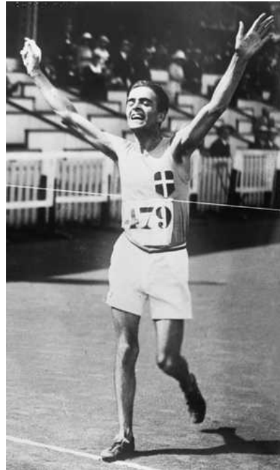
Frigerio wins the 10,000m Walk at the 1920 Olympic Games

He was an early developer and won his first Italian Open 10,000m walk title in 1919 at 17 years of age. The next year, he was again successful, winning gold in the Italian 10,000m and silver in the Italian 3,000m championship walks. These performances gained him selection for the 1920 Olympics in Antwerp as an 18 year old.