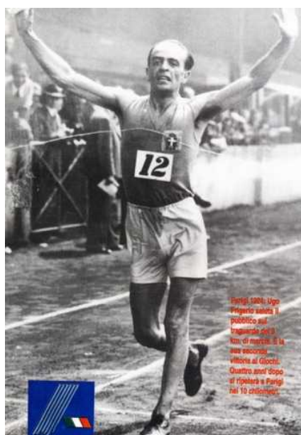
Ugo Frigerio wins the 1924 Olympic 10,000m Walk

But before that milestone was reached, happenings in the heats had made it reasonably certain that walking would not remain in the Games. The trouble developed over variations in the interpretation of walking and over difficulties in language. When an Austrian was ruled out, he appealed to the Jury on the grounds that he did not speak the language of the Judges who had disqualified him and had not understood the warnings they had given him. The jury agreed with the walker, over-ruled the Judges and ordered that the Austrian should compete in the second heat. The result was obvious. The panel of Judges resigned, and a new one had to be found before the event could go on. It only wanted something like this to happen, coupled with earlier troubles, and the fate of walking in the Games seemed sealed.