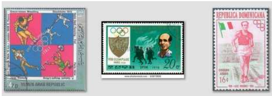
Postage stamps featuring Frigerio: Yemen (1971), DPR Korea (1978) and Dominican Republic (1957)

He also has the honour of having 3 postage stamps created in his honour