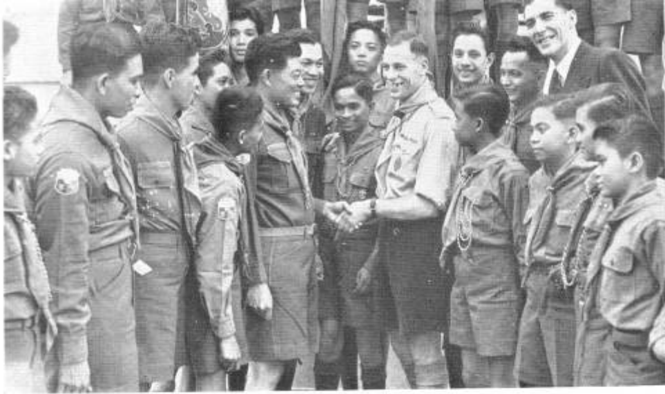
A British Scouter welcomes Philippine Scouts on their way to a Jamboree.