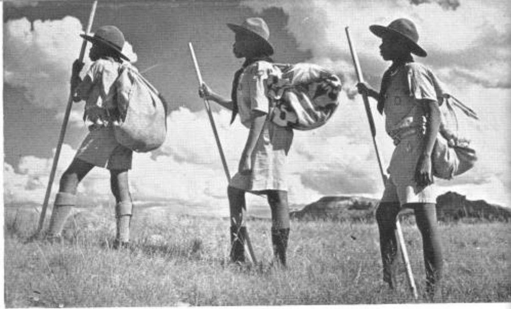
Pathfinder Scouts off on a hike in South Africa.