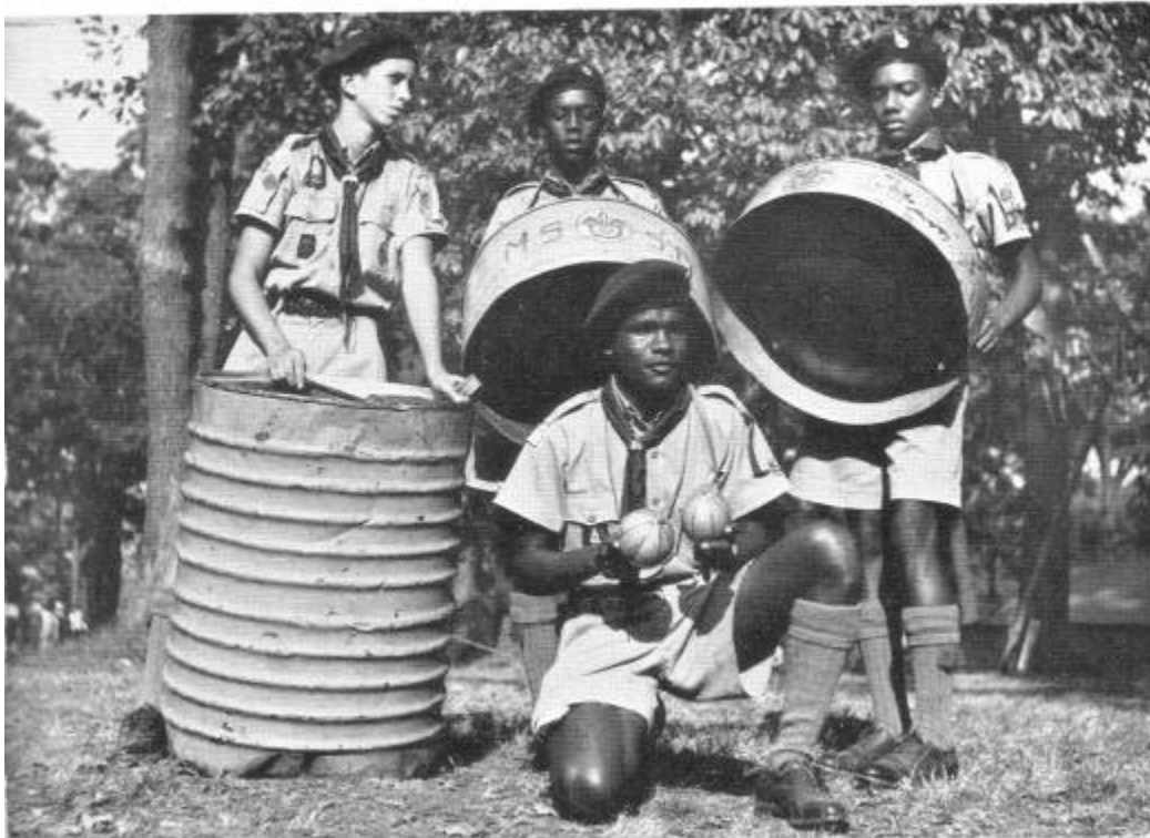
Trinidad Scout Steel Band at the Eighth World Jamboree, Niagara-on-the-Lake, Canada, 1955.