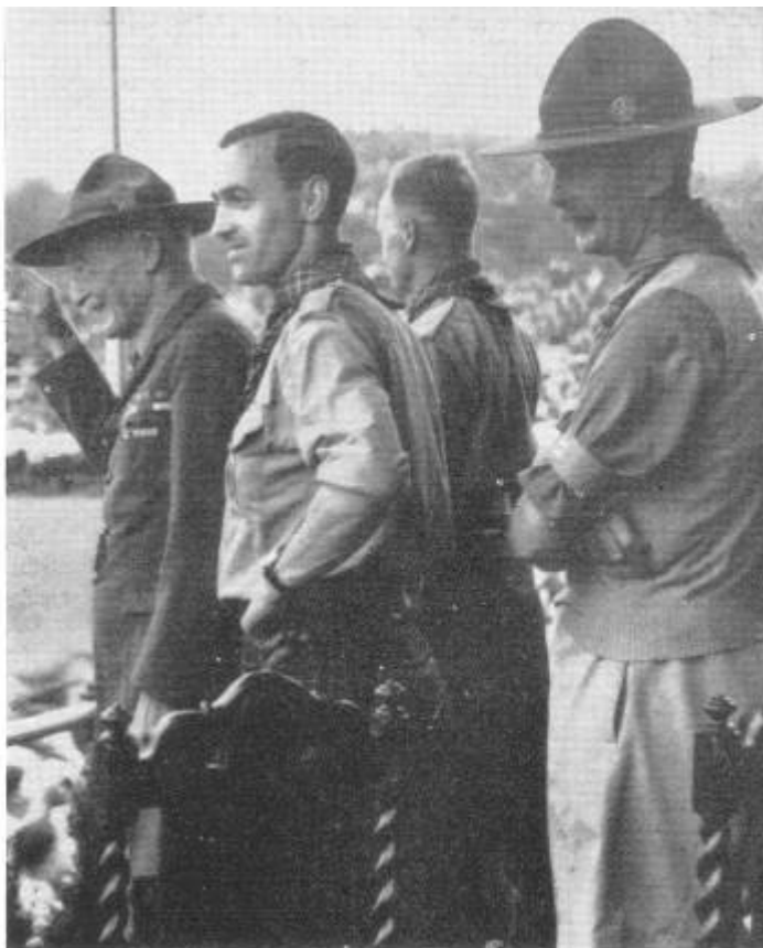
B.-P. and Lord Somers watching display of Scottish dancing with Jack Stewart, the producer, at the Vogeleisang Jamboree, 1937.