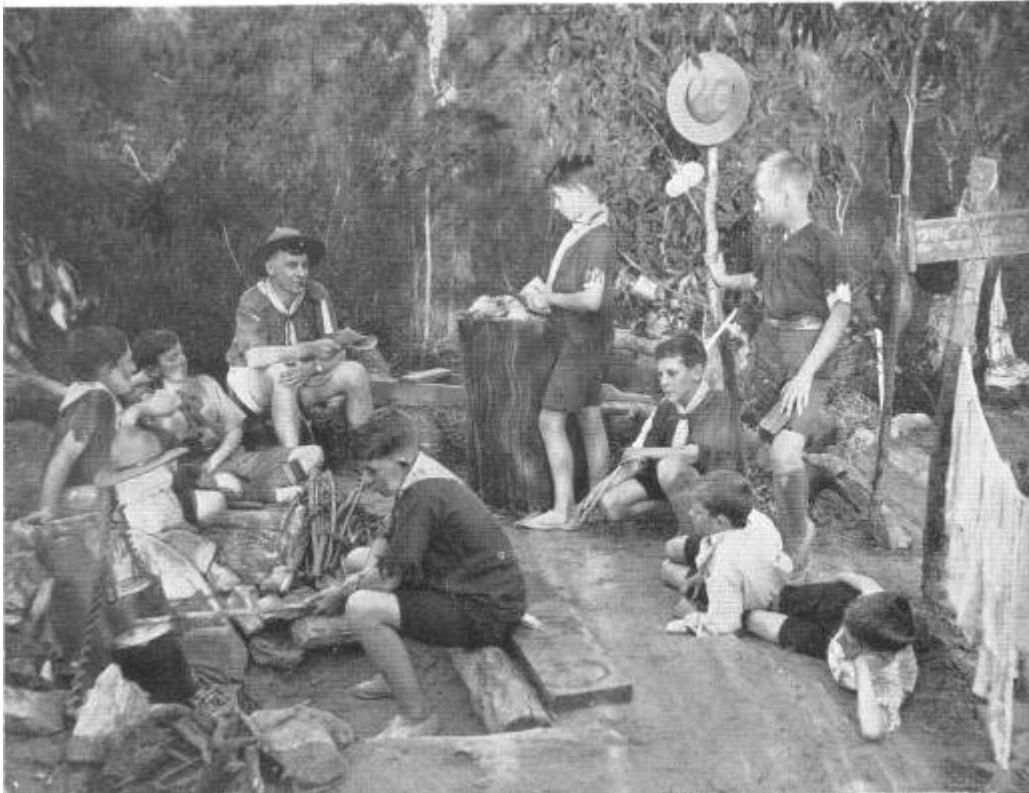
Australian Scouts in camp,