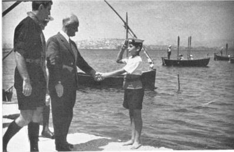
Greek Sea Scout greets J.S.W. at the Sea Scout Base shortly after his arrival at Athens airport, 1950.