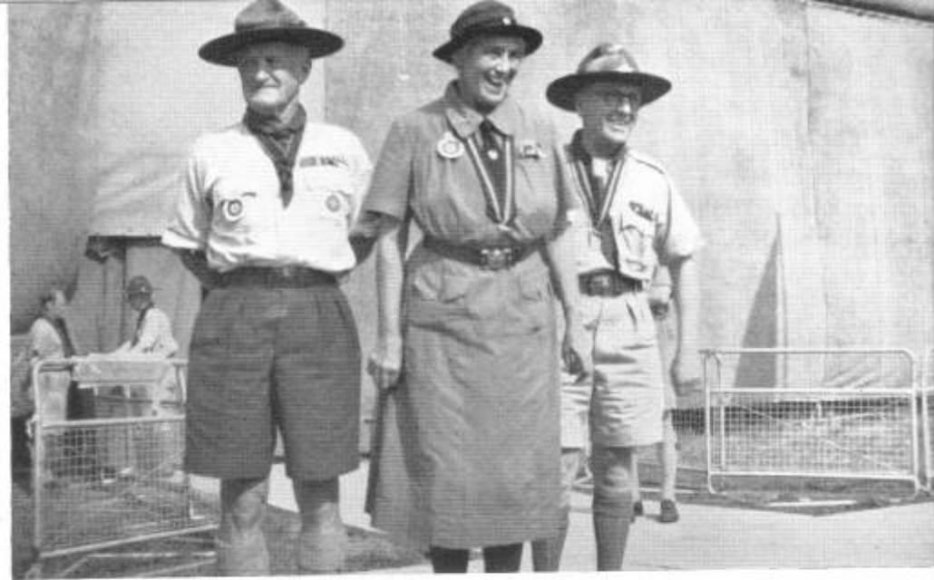
The President and Vice-President of the Boy Scouts International Committee with the Chief Scout for South Africa, at the Centenary-Jubilee Jamboree, 1957.