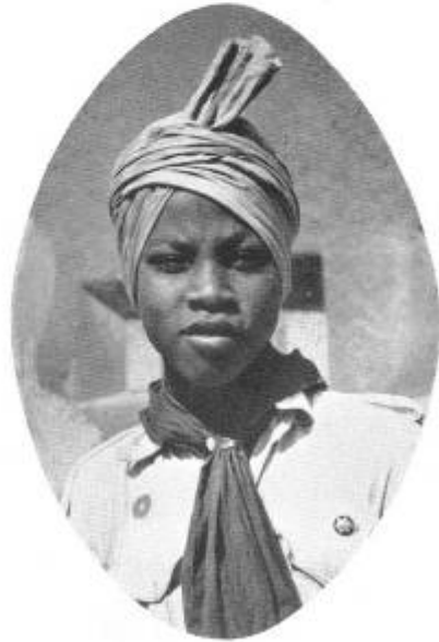
A Muslim Boy Scout from Northern Nigeria.