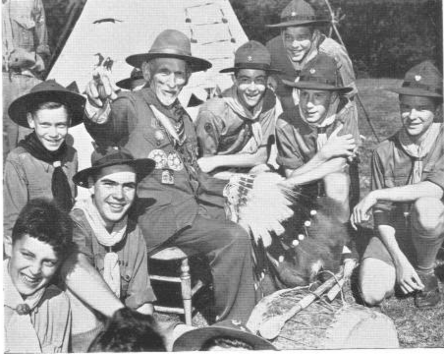
Dan Beard, National Commissioner of the Boy Scouts of America, with U.S. Scouts.