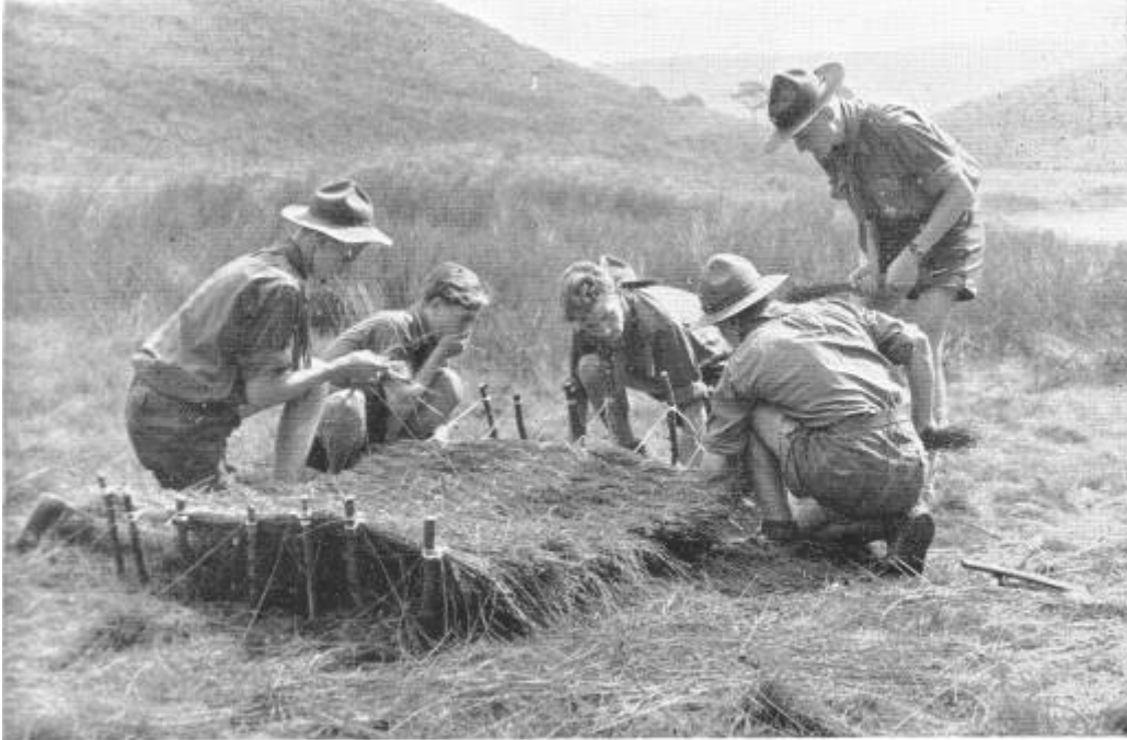
A Patrol of German Scouts making a camp mattress.

International Commissioners from all over the world meet during the Seventh World Jamboree at Bad Ischl, Austria, 1951.