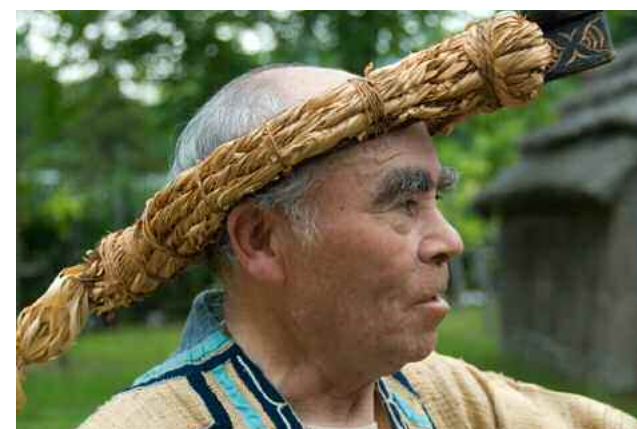
Ainu elder in traditional garb.

The Ainu language is still within a hair's breadth of vanishing; of the fewer than 100 native speakers recorded in the 1980s, no more than 15 used the language daily. That it has not disappeared is mainly due to Nibutani native Shigeru Kayano, the best-known of the Ainu activists. Kayano's work and charisma were instrumental in protecting the language.