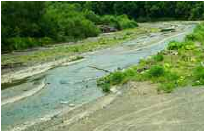
The Biratori River: targeted for a dam.

ing Kibata's ancestral lands. Access road construction has already begun.