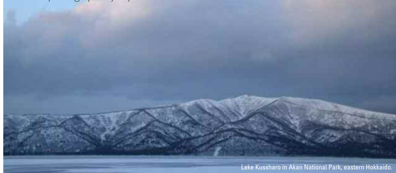
Lake Kussharo in Akan National Park, eastern Hokkaido.