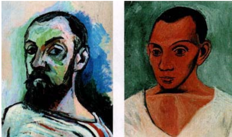
The visual dialogue between Matisse (far left, in a 1906 self-portrait) and Picasso (left, in a self-portrait of the same year) was especially intense in the years after the met, c.1906.

If Henri Matisse was regarded as the father of modern art at the dawn of the 20th century; Pablo Picasso was sleeping with the same muse. When Picasso finished his form-shattering masterpiece LES DEMOISELLES D'AVIGNON in 1907, portraying five prostitutes with primal masklike faces, their nudity more geometric than erotic, even his early dealer Ambroise Vollard blurted out, "It's the work of a madman." Matisse and Picasso didn't like each other's paintings at first, but they seemed to sense at once the power each had to challenge and stimulate the other. For the rest of their lives each would keep a keen eye on the other's new work, provoking each other to paint the same subjects, sometimes even with the same title. There are many ways to describe their relationship. It could be called a rivalry; a dialogue, a chess game--Matisse himself once compared it to a boxing match. But it also became the abiding friendship of two titans who, daring to paint the ugly; transformed our sense of beauty in art.