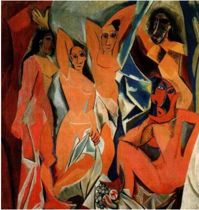
Picasso painted it in response to Matisse's daring, but more serene, 1905-1906 Le Bonheur do vivre and his radical Blue Nude (p. 67) of 1907.