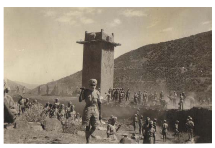
Waziristan\ tribal\ village\ demolition-1937.\

The destruction of his headquarters lowered the Faqir's prestige and ended the first phase of the operations. The firebrand of Ipi was temporarily a fugitive. The second phase, that of roadmaking, lasted without intermission until October 15th, 1937. There were occasional clashes with hostile gangs, but no organized resistance was encountered. On June 1st, the 1st Division relieved the Bannu and Razmak Brigades in the Sham Plain and the two brigades concentrated in the Razmak area.<sup>2</sup> Meanwhile, the Circular Road, which had been damaged between Dosalli and Razmak, had been re-opened by the combined efforts of the Sappers and Miners and the Military Engineer Services. The third and final phase of the operations took the form of an invasion of the Bhittani country